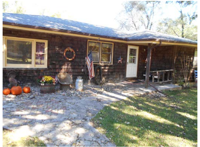
Front side of home