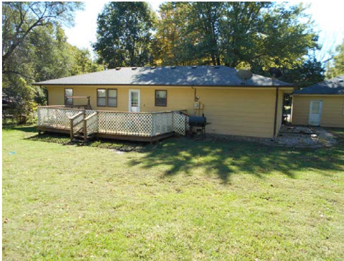
Back side of home

This is a nice cozy home located just walking distance from the school! It has plenty of extra space for storage and lots of shade! Seller's are even willing to put up a home warranty!