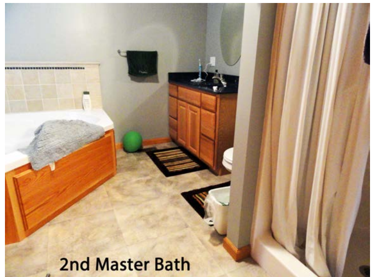
2nd Master Bath