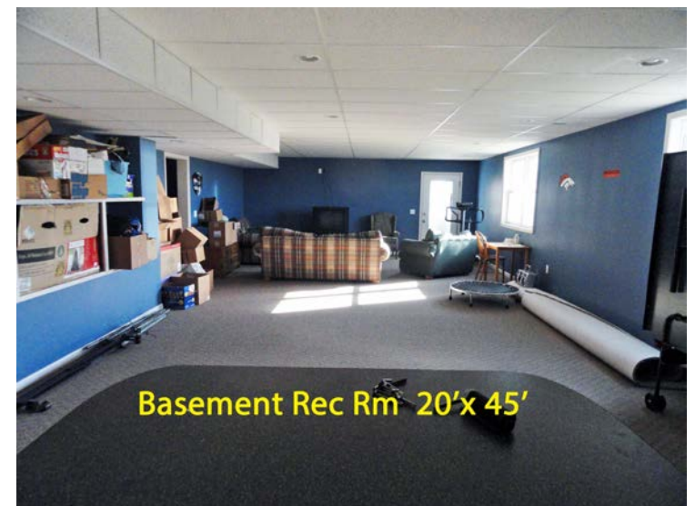
Basement Rec Rm 20'x 45'