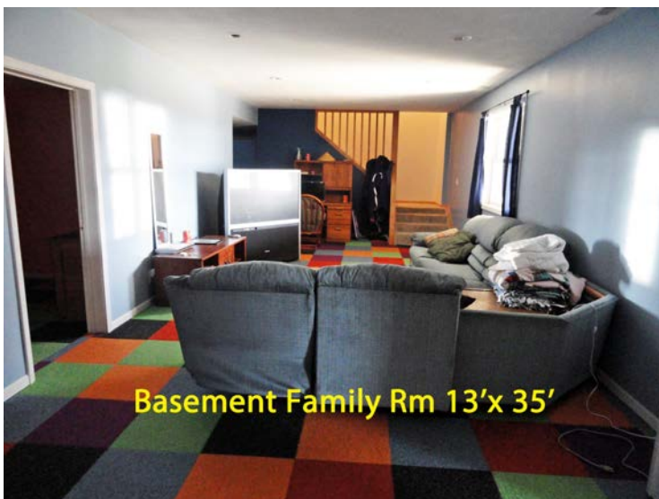
Basement Family Rm 13'x 35'