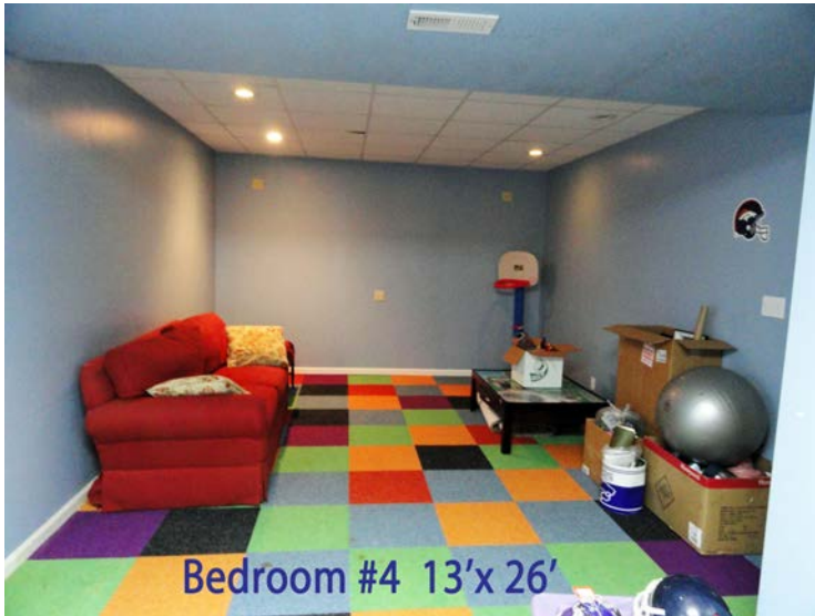
Bedroom #4 13'x 26'