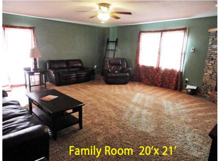
Family Room 20'x 21'