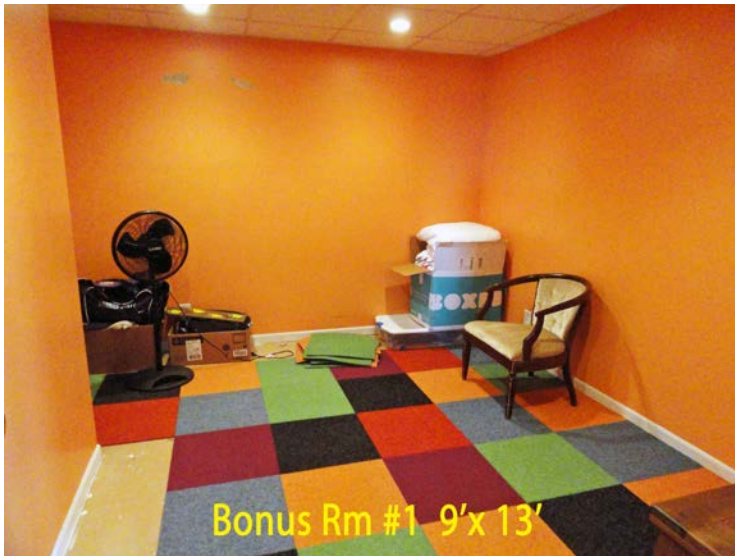
Bonus Rm #1 9'x 13'