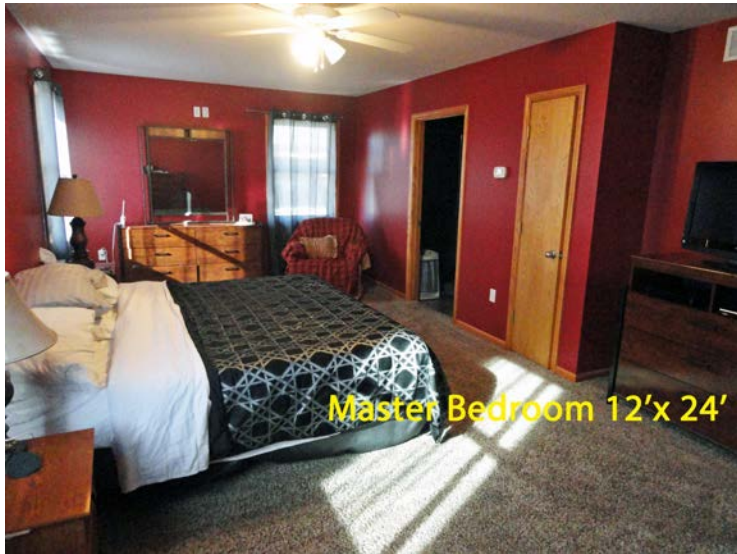
Master Bedroom 12'x 24'