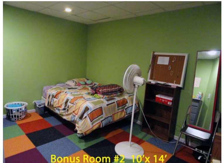
Bonus Room #2 10'x 14'