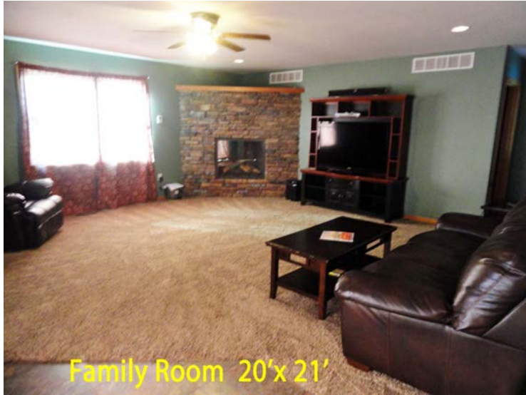
Family Room 20'x 21'