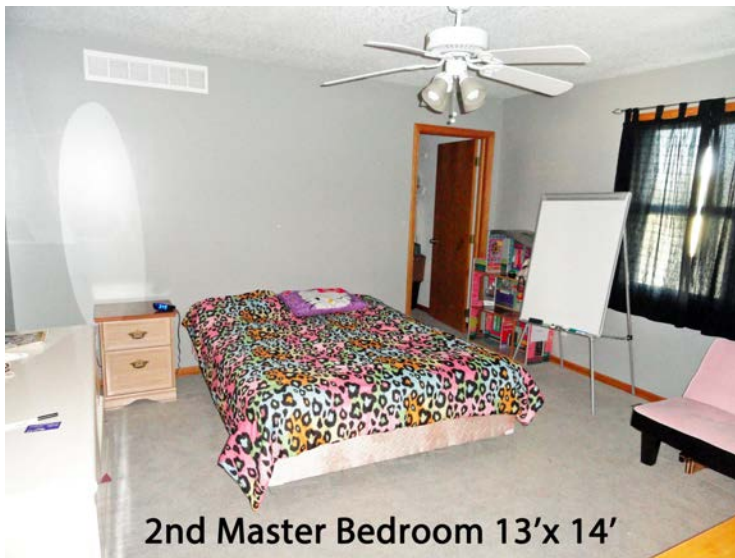
2nd Master Bedroom 13'x 14'