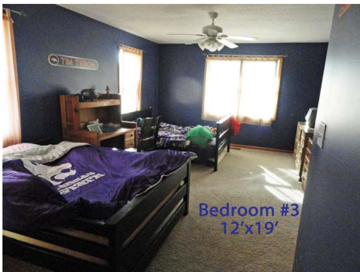
Bedroom #3 12'x19'