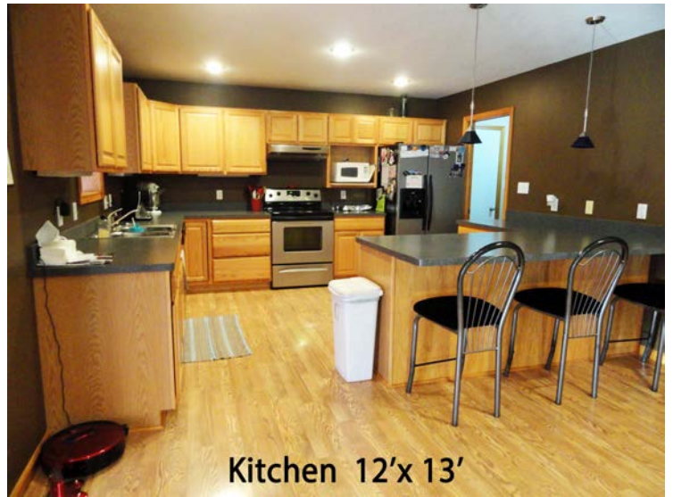
Kitchen 12'x 13'