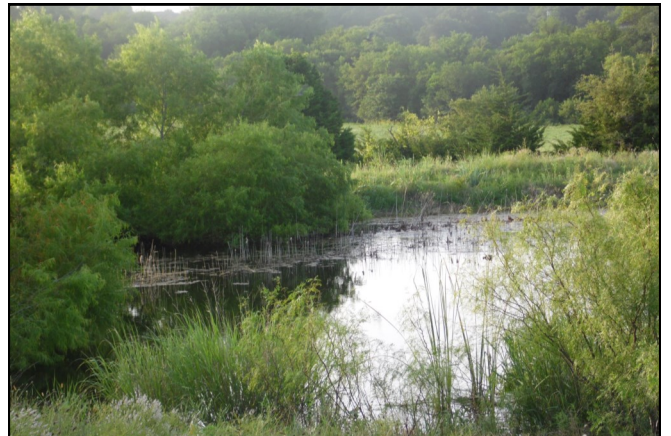
One Of Several Ponds