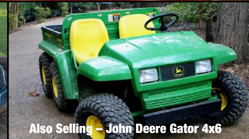
Also Selling – John Deere Gator 4x6