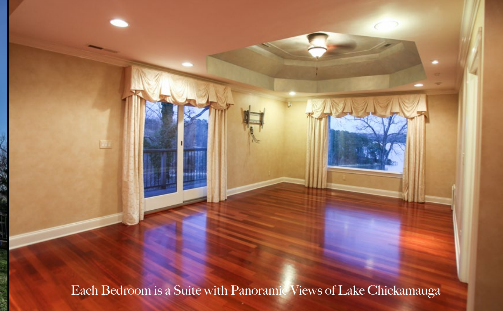
Each Bedroom is a Suite with Panoramic Views of Lake Chickamauga