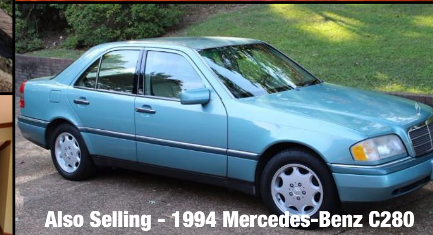
Also Selling - 1994 Mercedes-Benz C280