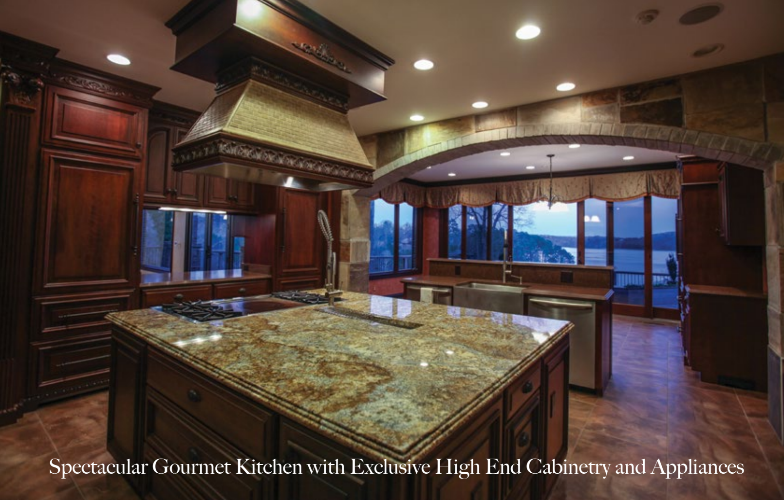
Spectacular Gourmet Kitchen with Exclusive High End Cabinetry and Appliances