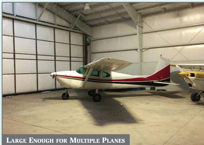
LARGE ENOUGH FOR MULTIPLE PLANES

For those that fly their own aircraft this hangar is a must see!