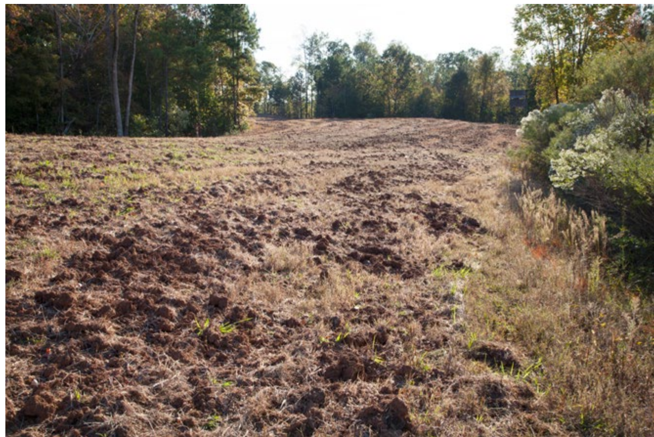
2.5 Acre Greenfield with a view to the Southwest. 6 acres of longleaf pine planted down the slope.