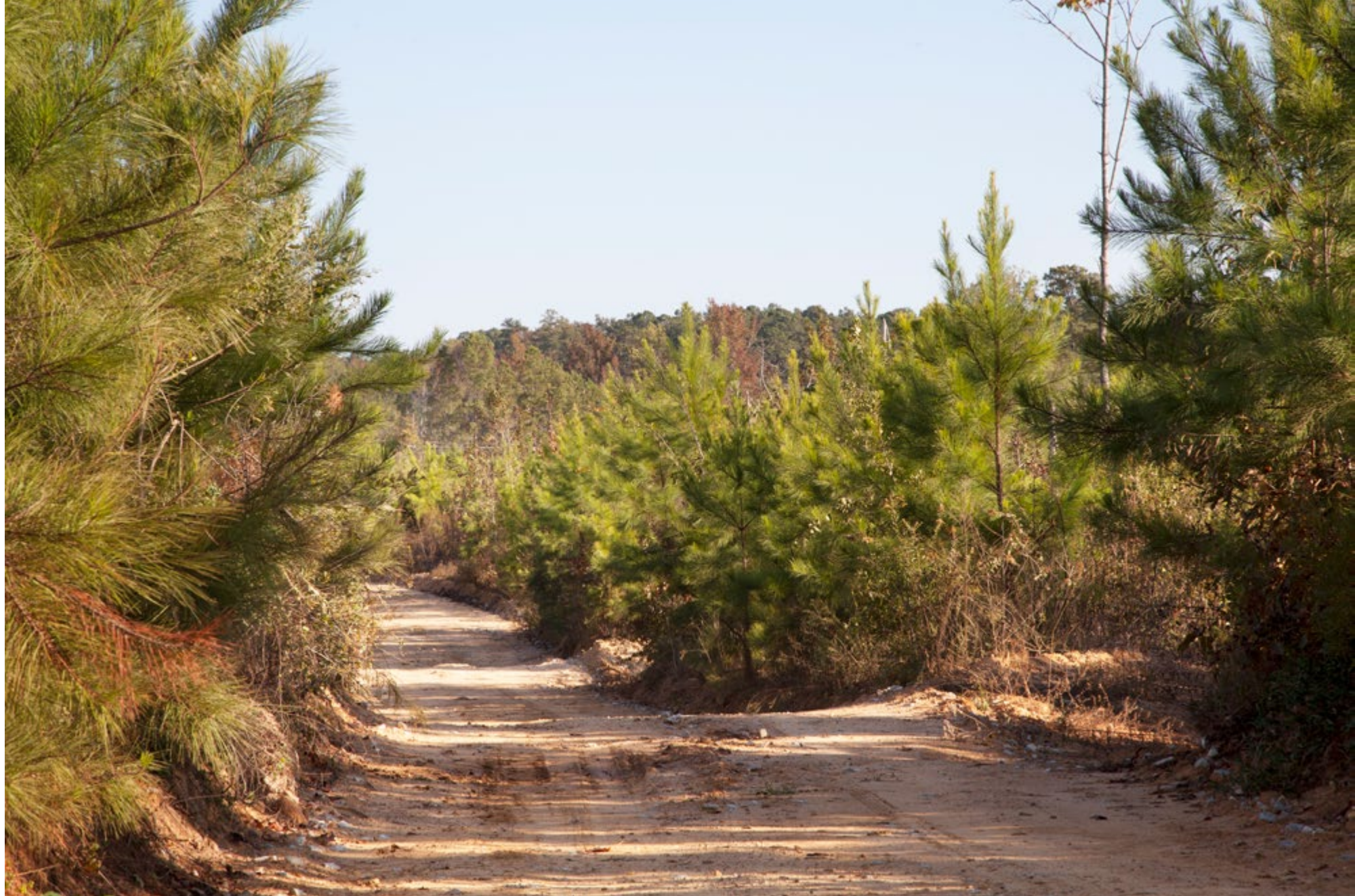
27 Acres of loblolly planted in 2010 and 6 acres of longleaf pine planted in 2011. The road follows the ridge top and there is a deeded easement along the road connecting the two forty acre tracts.