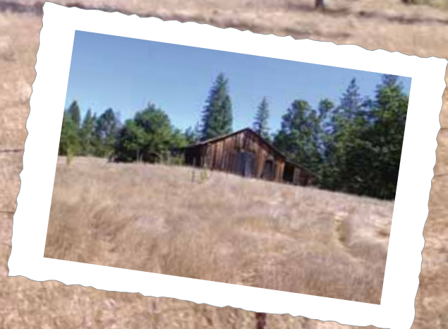
12.05 acres with ranch house, barn, well, orchard and fenced pastures.