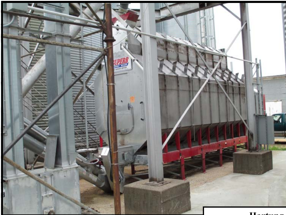
Hartung Elevator ~ Dryer Brock SuPurb Dryer—1500 BPH