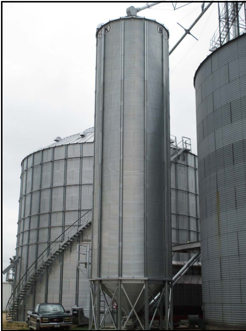
Hartung Elevator ~ Grain Tank #2 Base 9,000 Bu. Steel Hopper