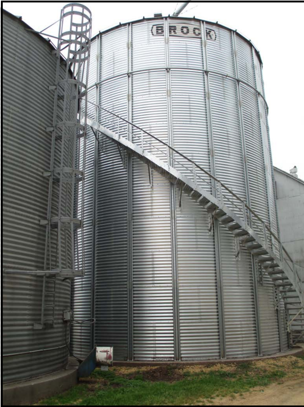
Hartung Elevator ~ Grain Tank #1 19,689 Bu. Steel Tank Unload 10" x 15' Auger 15 HP Centrifugal Fan