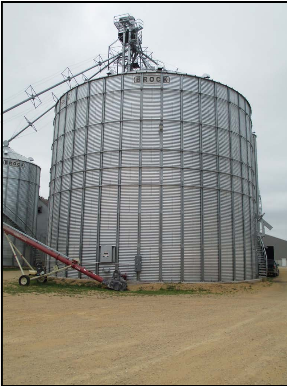
Hartung Elevator ~ Grain Tank #6 122,000 Bu. Steel Tank Loading: 14" x 60' U-trough Drag Unload 10" x 30' Auger 20 HP Centrifugal Fan