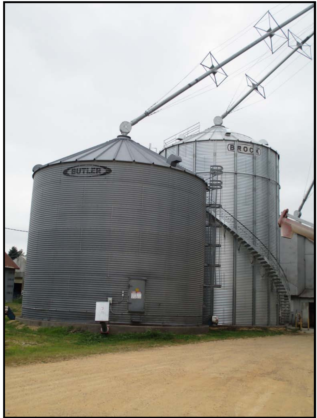
Hartung Elevator ~ Grain Tank #4 19,300 Bu. Steel Tank Unload 8" x 25' Auger 2-5 HP Axial Fan