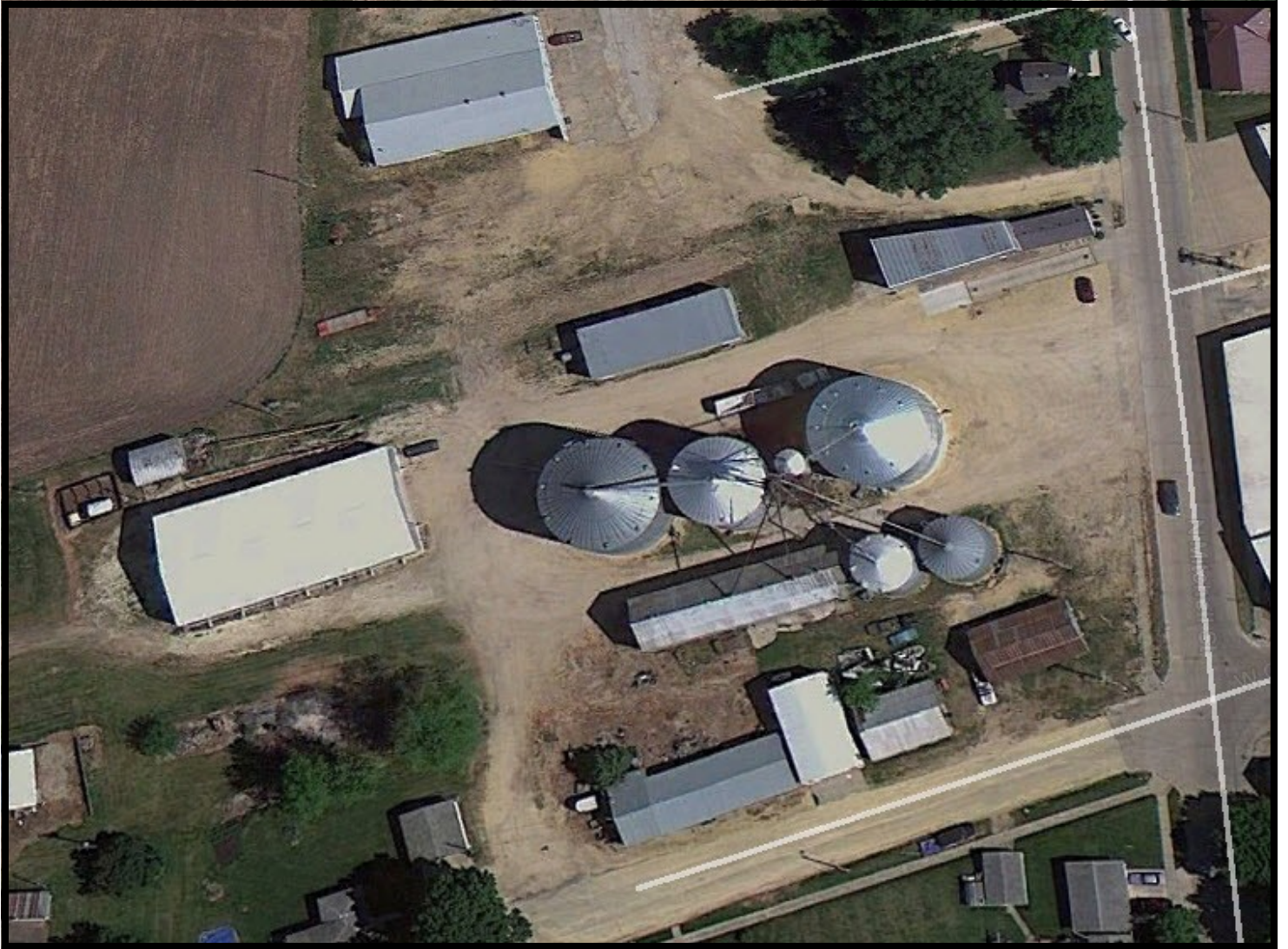
Hartung Elevator 23 N. Mitchell St. Preston, IA