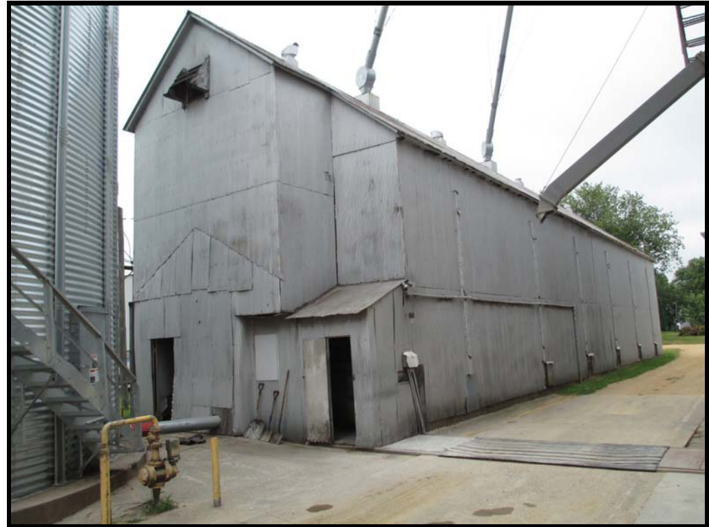
Hartung Elevator ~ Grain Tank #4 Older Flat F-1 Through F-6 Total 42,000 Bu.