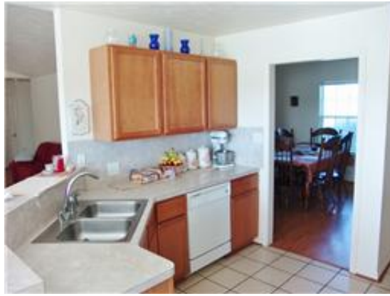
Open Kitchen w / lots of counter space & breakfast bar