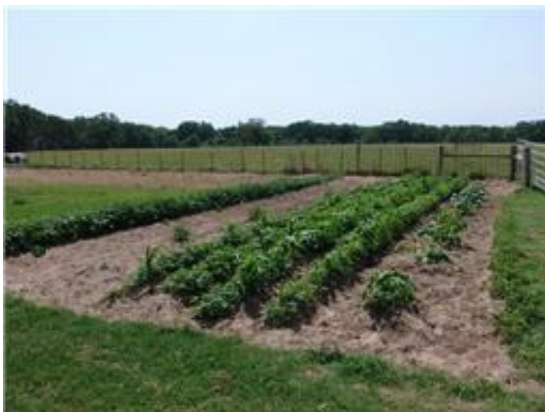
A garden full of good things!