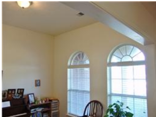
Living room - plenty of natural light