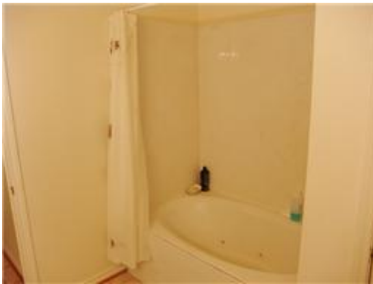
Master bath w ith jetted tub