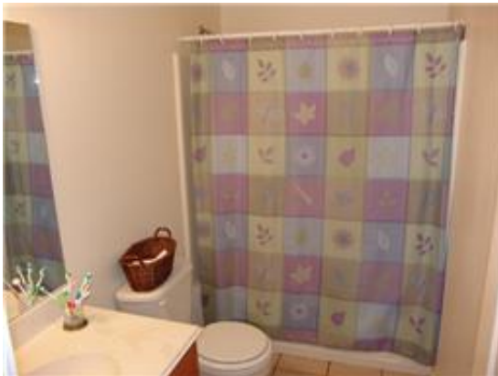
1 of 3 Bathrooms