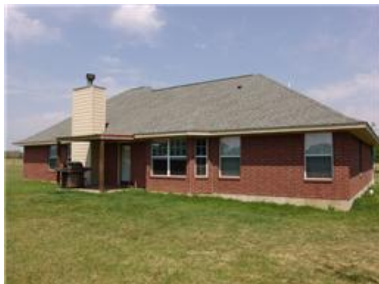
Back view of home