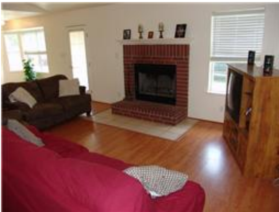
Wood burning FP & durable, attractive laminate flooring