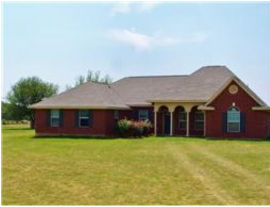
Front view of 4/3/2CPT Brick Home - 2270SF