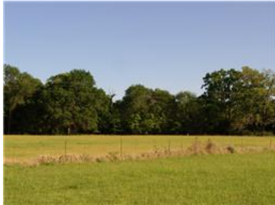
Improved fencing & view of fencing