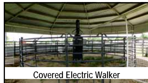
Covered Electric Walker