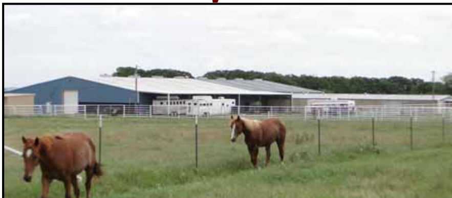
Main 15-Stall Horse Barn w. Covered Indoor Arena