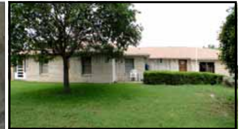
Brick ranch style home w. tile floors, fireplace, and wood paneling