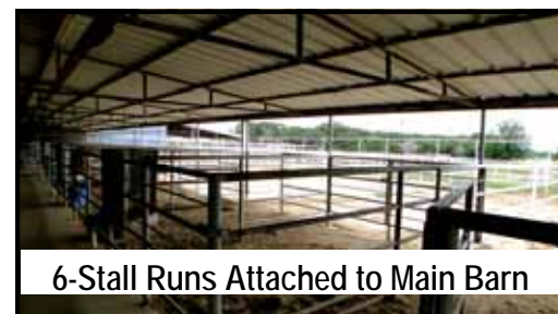
6-Stall Runs Attached to Main Barn