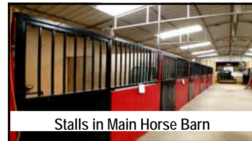
Stalls in Main Horse Barn