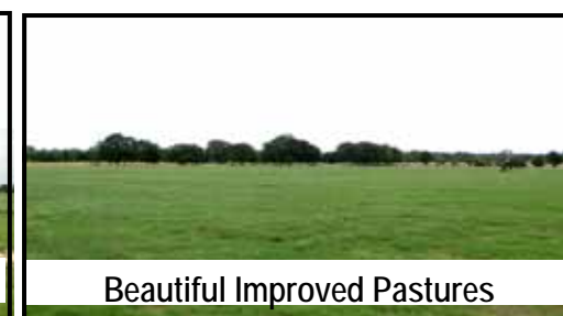
Beautiful Improved Pastures