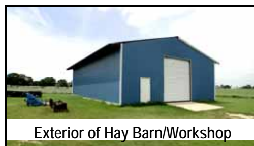
Exterior of Hay Barn/Workshop