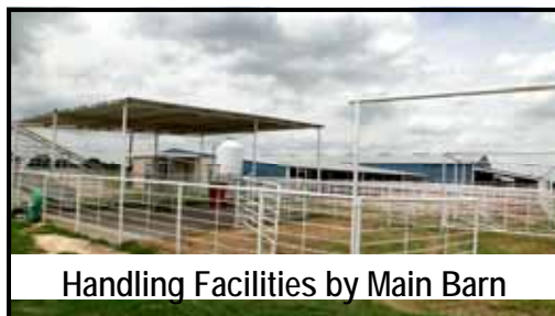
Handling Facilities by Main Barn