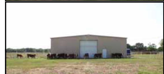
3600 SF Hay Barn