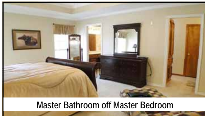
Master Bathroom off Master Bedroom