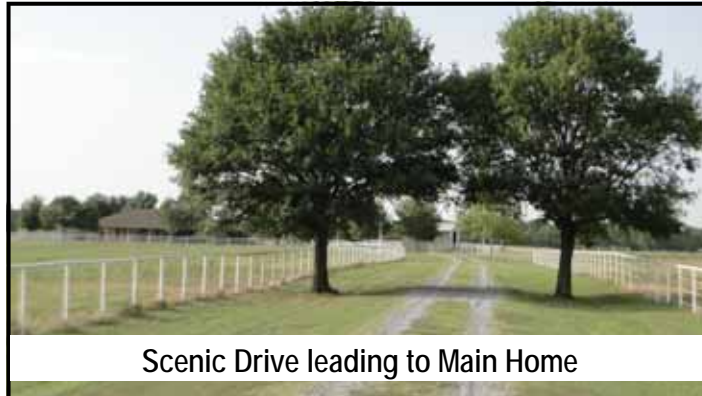
Scenic Drive leading to Main Home