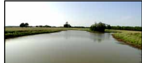
1.5 Acre Lake