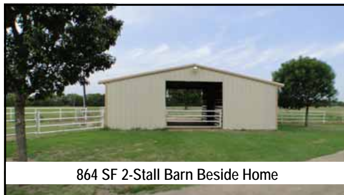
864 SF 2-Stall Barn Beside Home