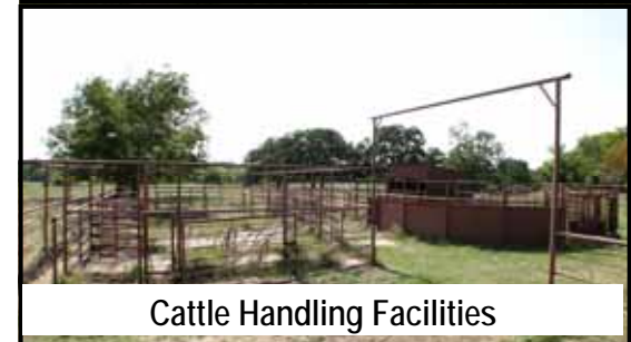
Cattle Handling Facilities