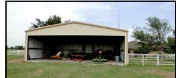
1200 SF Equipment Shed