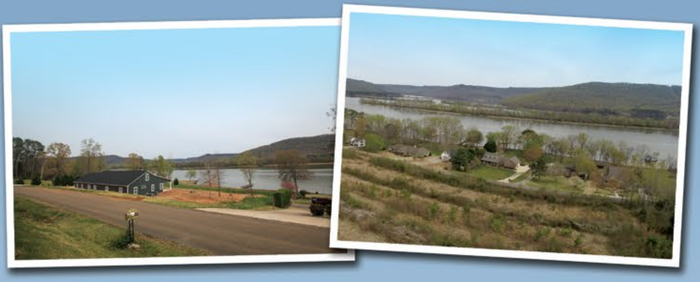
Snodgrass Rd & Driftwood Shores Dr., Scottsboro, AL