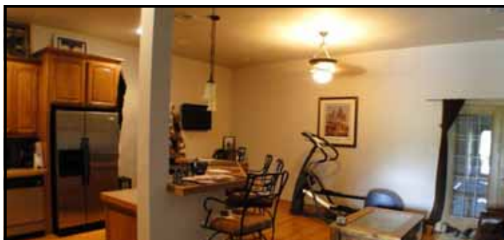
APARTMENT KITCHEN AND LIVING ROOM