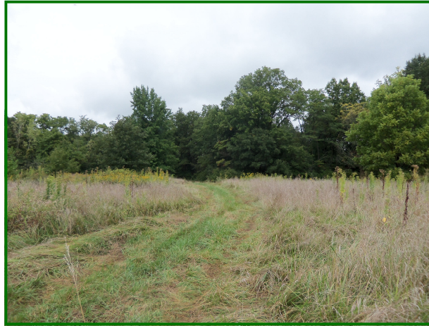
Section 21, Township 12 North, Range 10 West

2240 W. Morton Jacksonville, IL 62650 Phone 217-245-1618 Fax 217-245-5318 www.worrell-leka.com