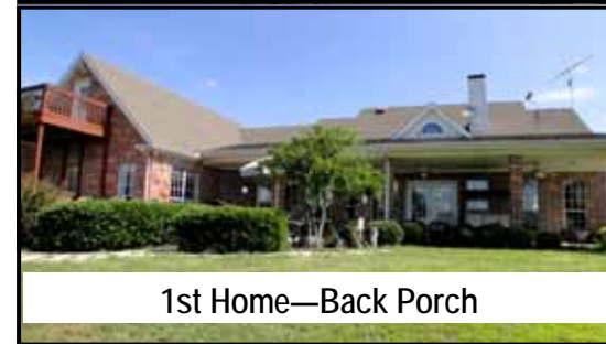
1st Home—Back Porch