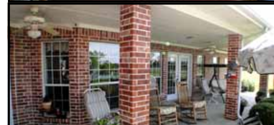
1st Home—Back Porch