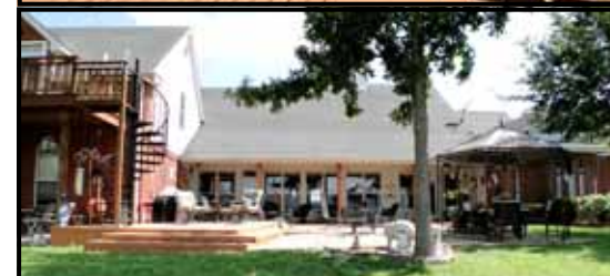
2nd Home—Back Porch