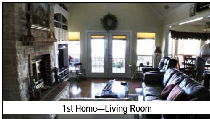
1st Home—Living Room