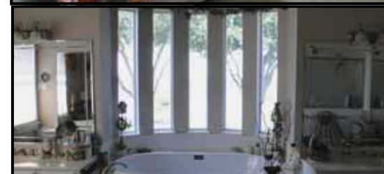
2nd Home—Master Suite