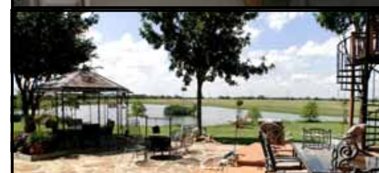
2nd Home—Back Porch