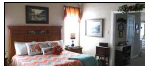
2nd Home—Master Suite