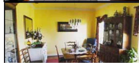
1st Home—Formal Dining