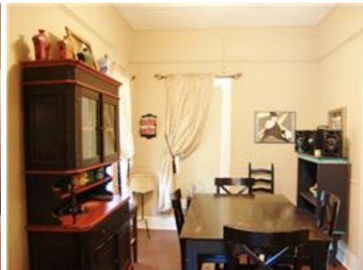
Lots of natural light make this the perfect entertaining setting