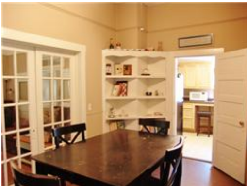
Formal DR - easily accessed thru kitchen or LR make entertaining a snap!