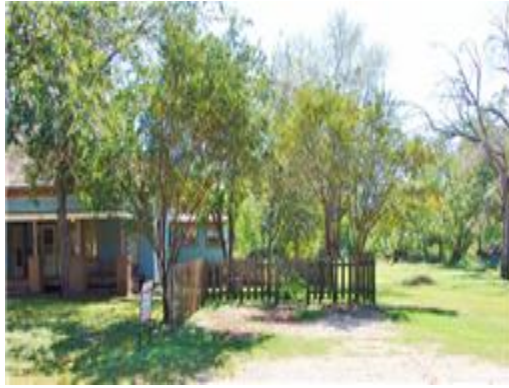
Additional parking space

Data Not Verified/Guaranteed by MLS Obtain signed HAR Broker Notice to Buyer Form