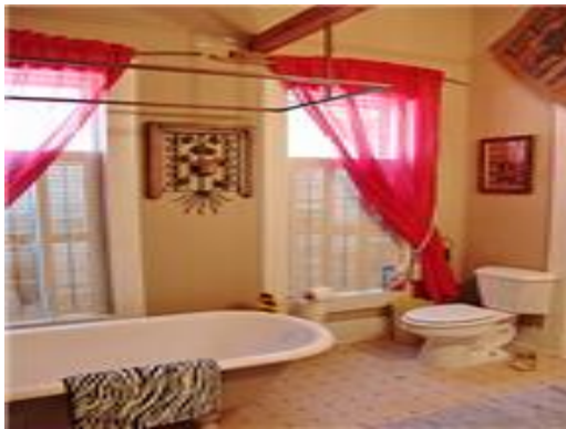
All that's missing from this bathroom is the bubble bath