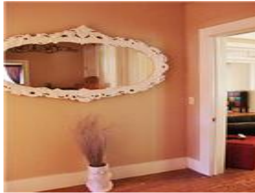
Hallway - Victorian style is carried thru out the home