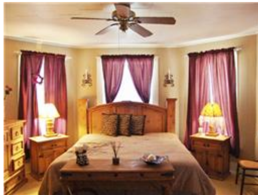
Mst Bdrm features a sophisticated style fit for a queen!