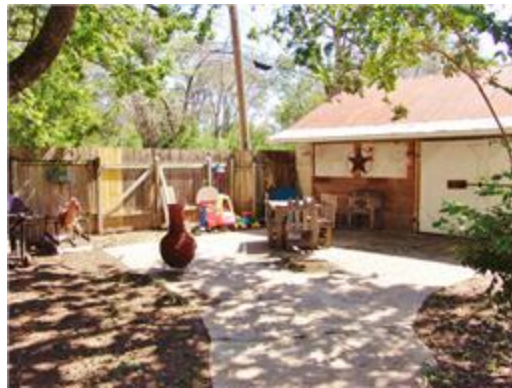
Garage & patio area