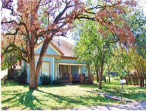
Beautiful Victorian style home