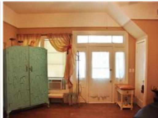
LR - High ceilings, wood floors & architectural detail make this pretty as a picture