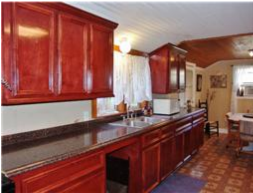
Beautiful, rich custom cabinetry complete the look of this kitchen