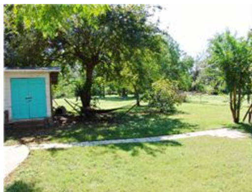
Path leading from patio to back yard