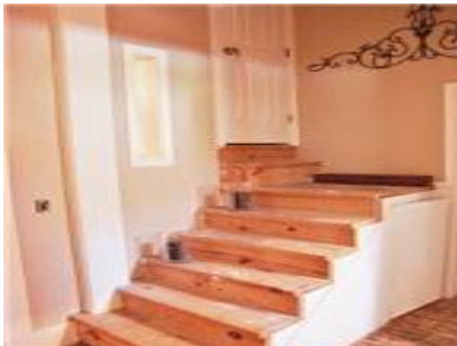
Stairway leads to the attic - Finish it out for a 3rd BR