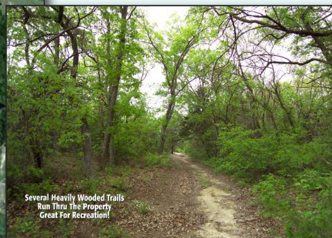
Several Heavily Wooded Trails Run Thru The Property Great For Recreation!