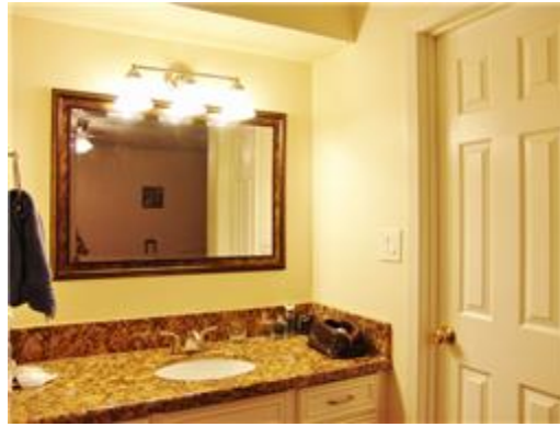
Impress your guests with granite counters & trendy fixtures!