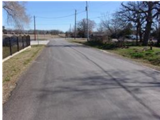
Easy access to schools, shopping & parks

Data Not Verified/Guaranteed by MLS Obtain signed HAR Broker Notice to Buyer Form