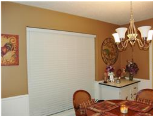
Dining rm located next to kitchen makes entertaining easy!