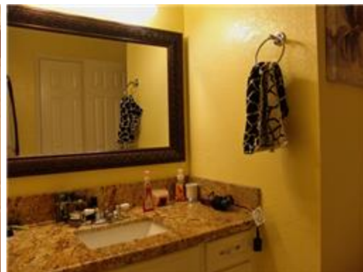
Master bath: new granite counters!