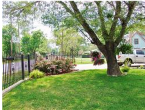
Well maintained landscaping