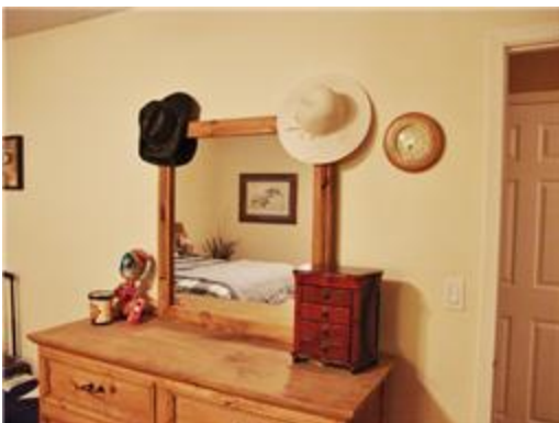
Master bedroom - 2nd view