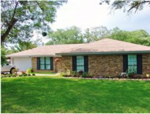
Front view of lovely 3/2/1Gar!!Cpt brick home