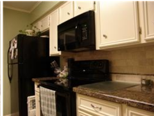
Updated appliances & lots of counter space