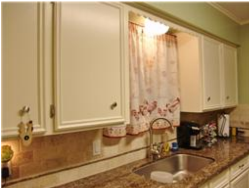
Kitchen: new granite counters & tile backsplash