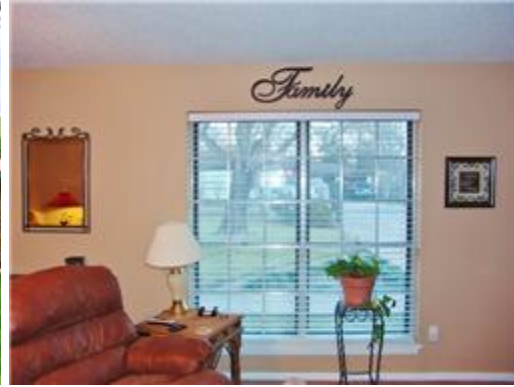
Large, open living room