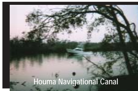
Houma Navigational Canal

Wildlife abounds on entire property and underdeveloped acres could be preserved for hunting, fishing, nature trails or other outdoor activities. The property also borders and provides access to Bayou Grand Caillou.