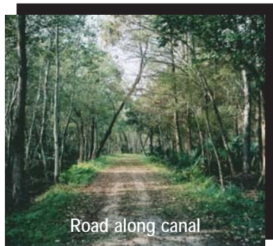
Road along canal