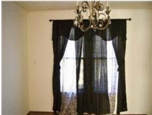
Formal Dining Rm