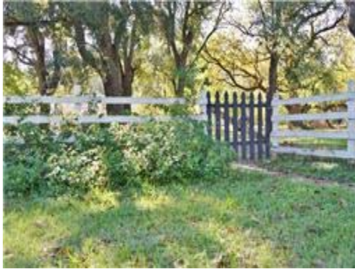
Entrance to back yard