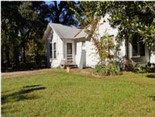
Side view of corner lot