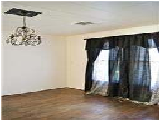
Formal Dining Rm - 2nd View