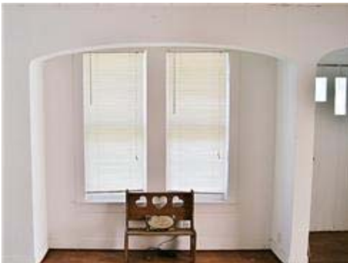
Living Rm - 2nd view