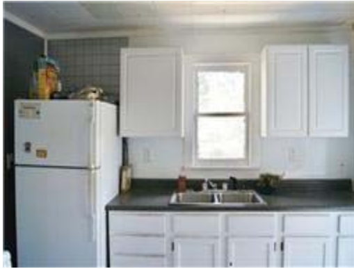
Kitchen - updated fixtures & counter tops. Frig Conveys!