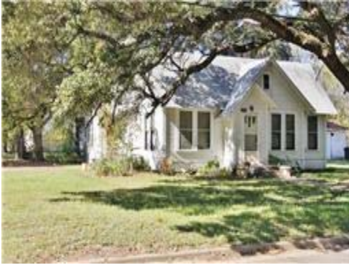
Front view - 1167 SF