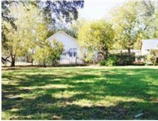
Oversized back yard