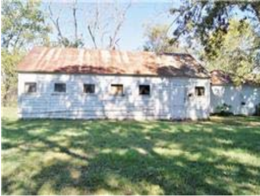
Outbuilding & garage