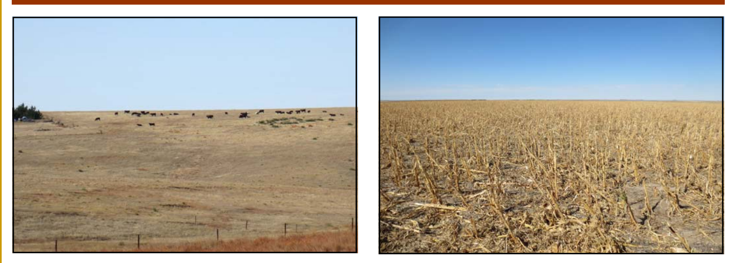
583± Acres of Cheyenne County land is located 8 miles west and 1 mile north of St. Francis, KS. along Highway 36, between roads 5 & 6.