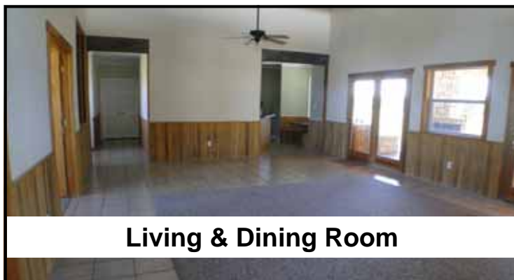
Living & Dining Room