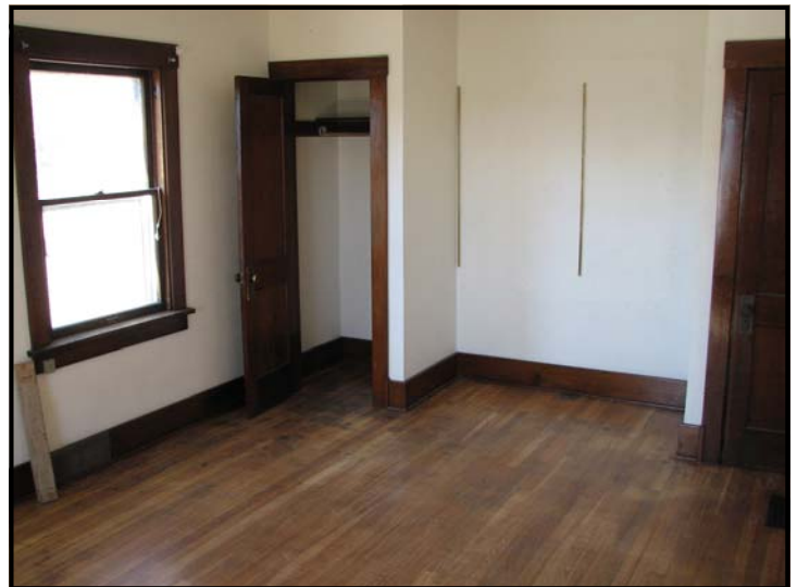
All Hardwood Floors Throughout