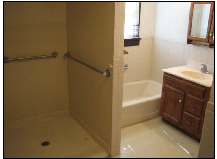
Main Floor - Handicap Accessible Shower