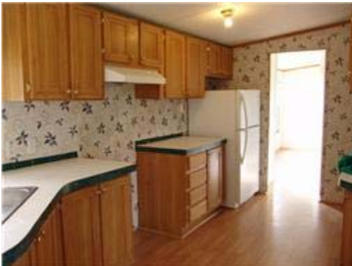
Kitchen opens directly into LR