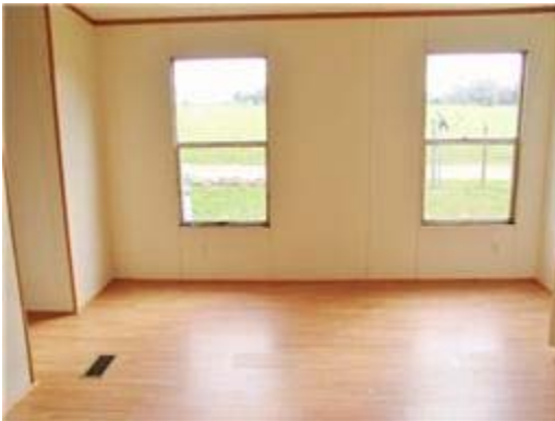
2nd view of Mst BR - lots of natural light!