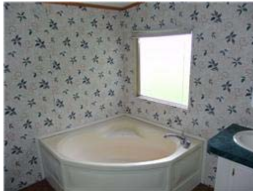
Master bath w/ soaking tub