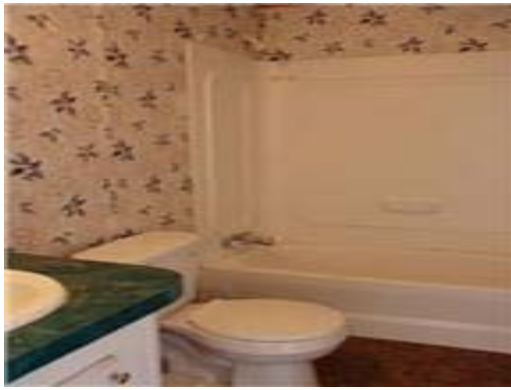
2nd full bath