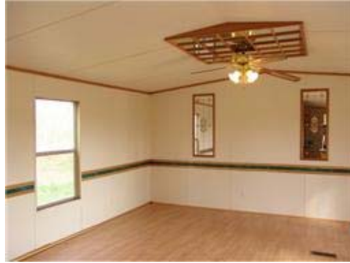
Spacious LR w/ new wood laminate flooring