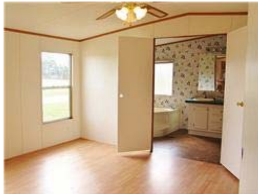
Master BR w/ ensuite bath