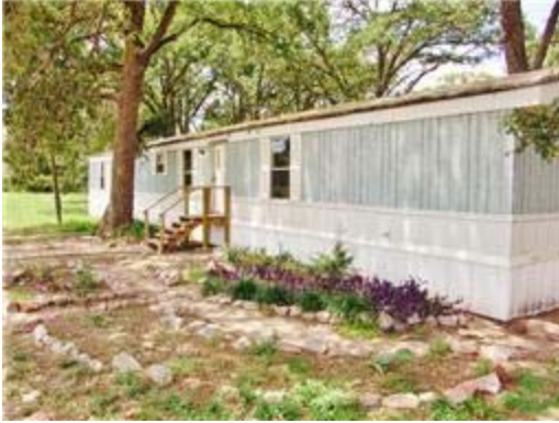
Front view of 1140 SF home