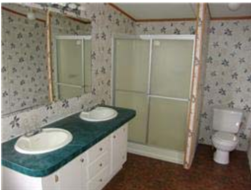
And don't forget the separate tub