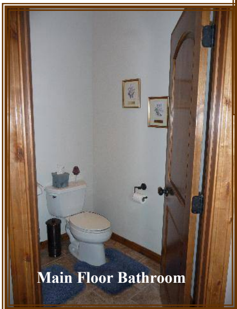
Main Floor Bathroom