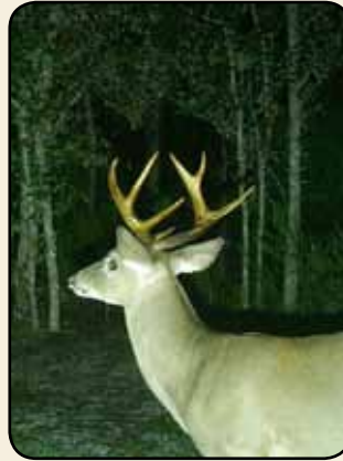
223 +/- acres of Lakefront Hunting & Fishing