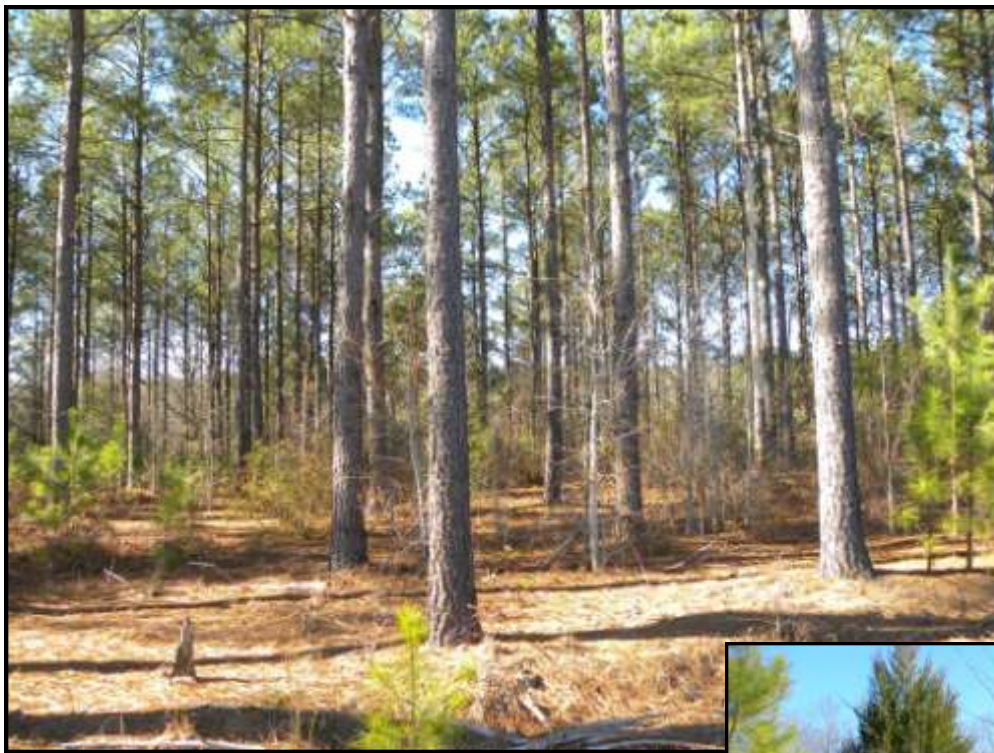
Healthy pine plantation approximately 18 - 20 yrs old on Tract 1

Several nice game plots are located throughout the property, and make this a great hunting tract