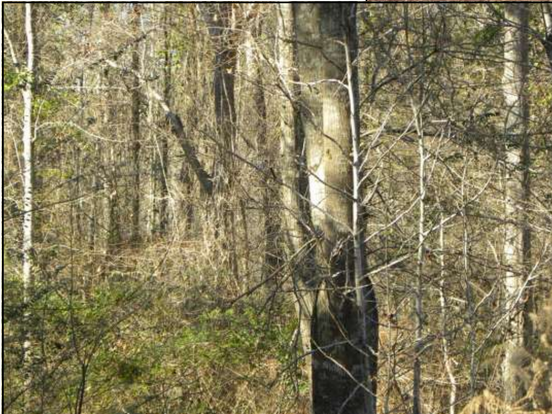
Tract has a good mixture of natural pine and hardwood timber