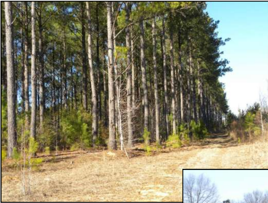
Nice internal road along Pine Plantation