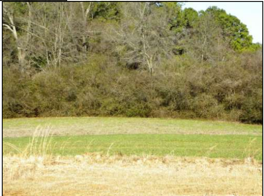
Game plot located on Tract 2 with timber in the distance