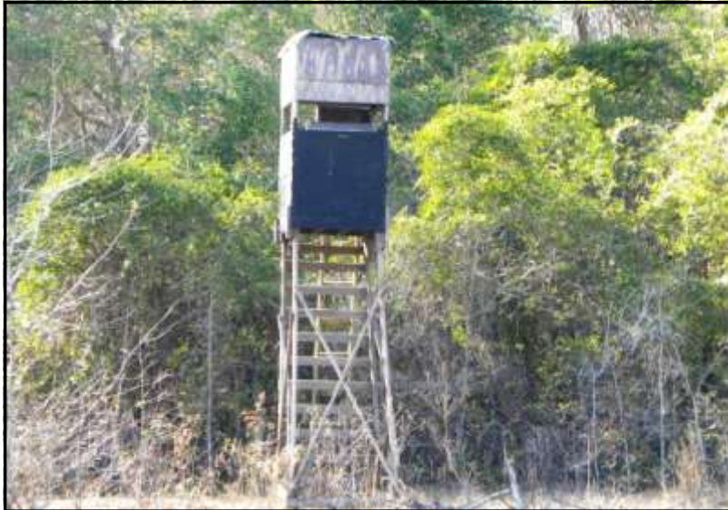
Elevated shooting house overlooking game plot located on Tract 1