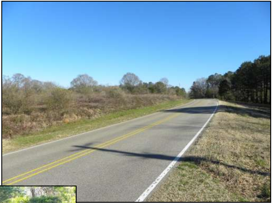
Highway 11 road frontage with water and utilities located along the highway