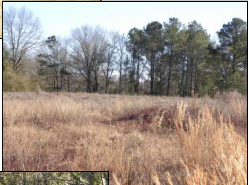
Open field with timber in background