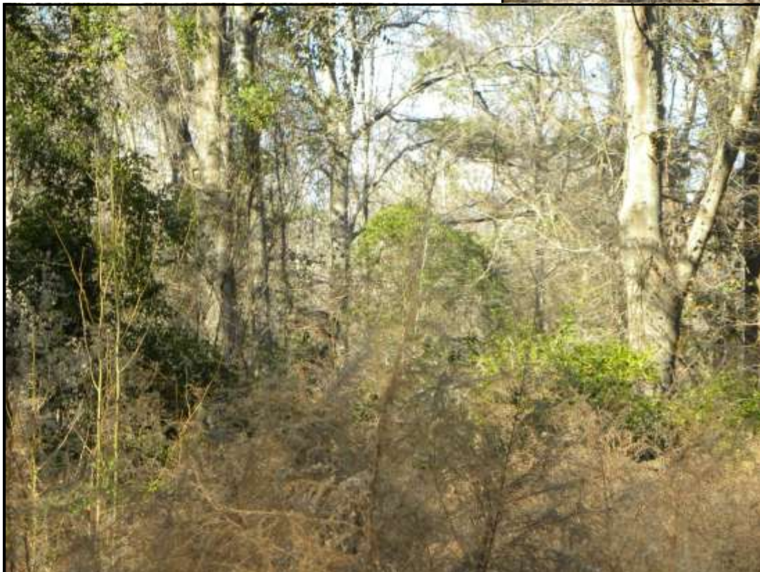
Large hardwoods located on Tract 2