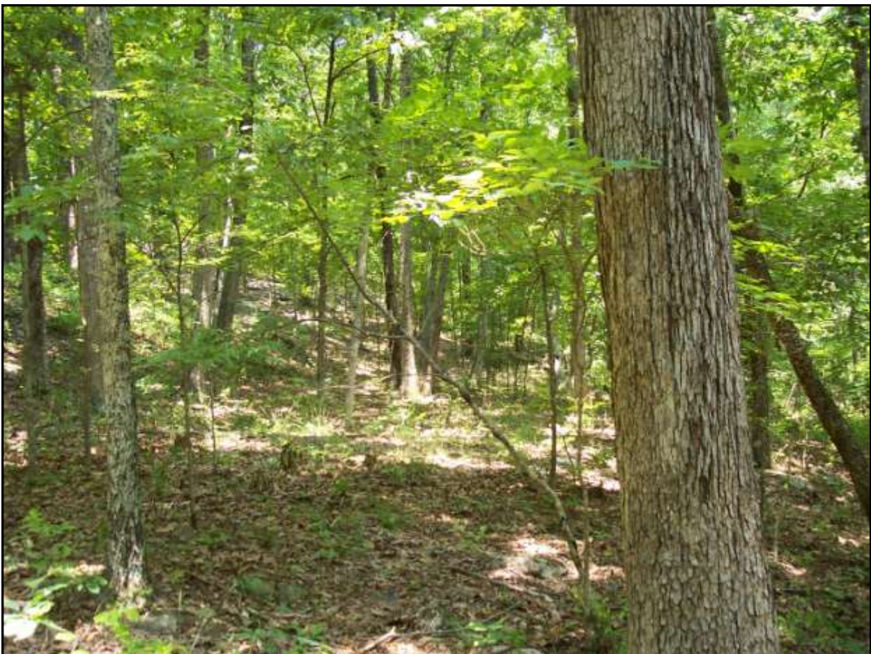
Beautiful hardwood timber along streams