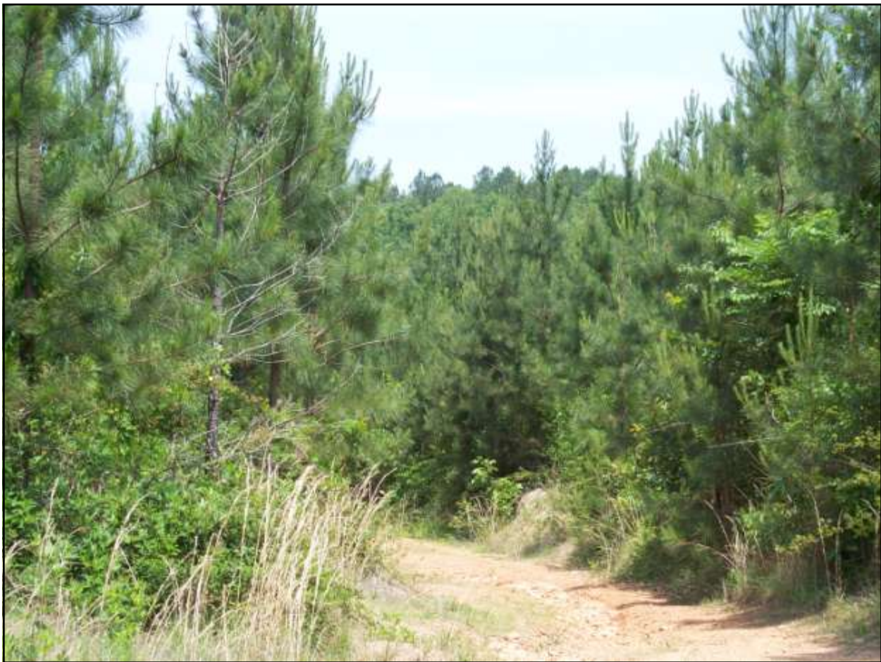
Good internal roads throughout the healthy pine plantation