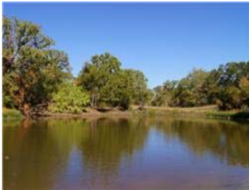
1 of 4 ponds