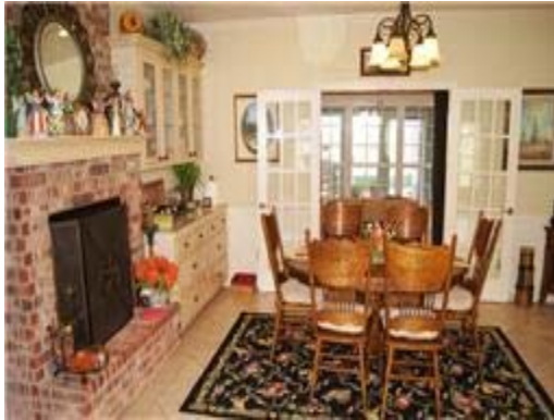
Beautiful fire-side dining