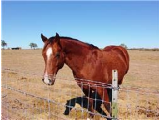
Horse grazing pasture