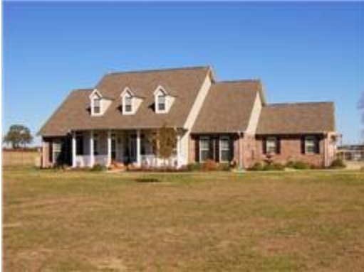
Stunning front view of 2847SF home & 218+ Acres