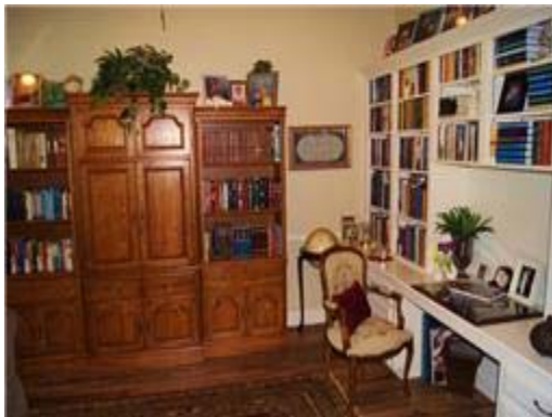
Library features abundant space for literature & musical/ref materials