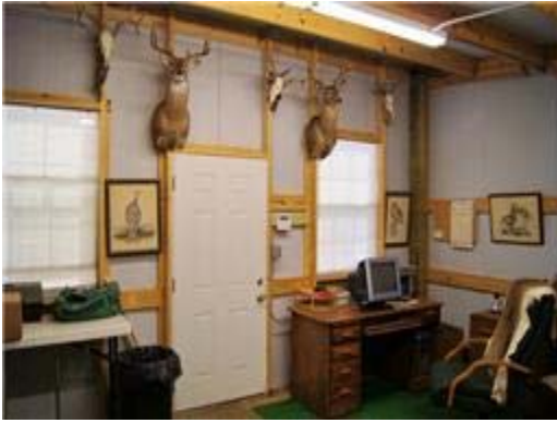
20X15 Man Cave - attached to 30X30 metal building