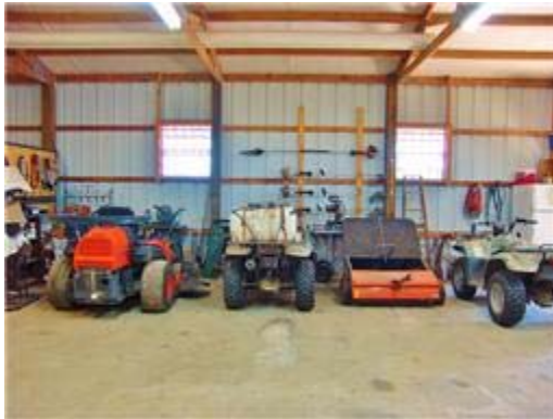
Interior of metal building