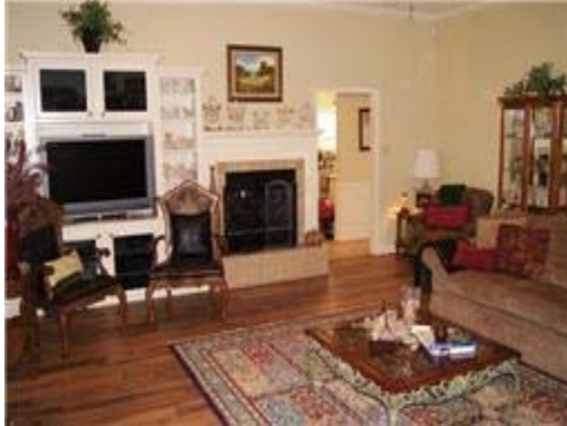
Cozy living room w/ built-ins & wood-burning FP