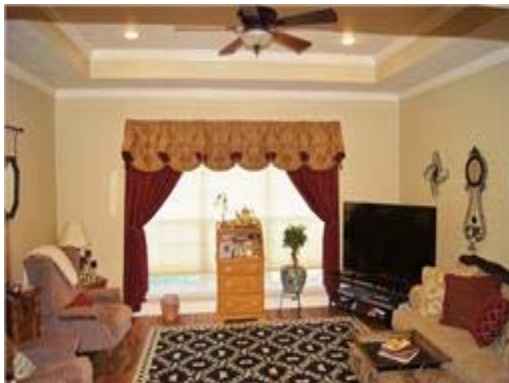
Master bedroom sitting area