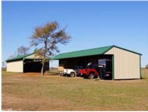
Additional 50X20 Equipment Shed