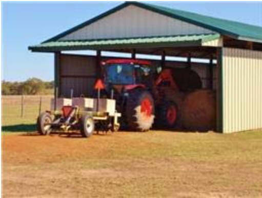
80X24 Hay barn