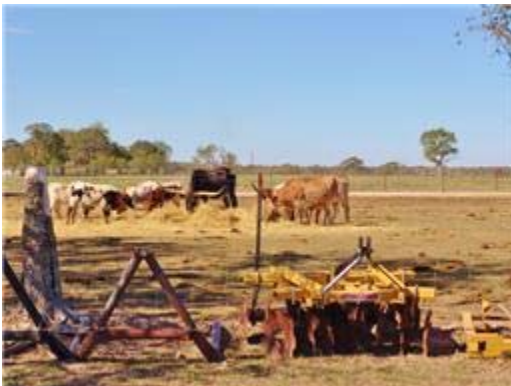
View of neighboring Long-Horn cattle