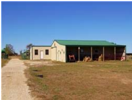
30X30 metal building on slab w/ electricity & attached equip shed