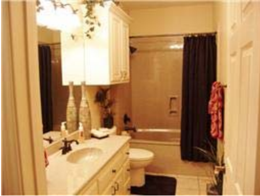
2nd full bath