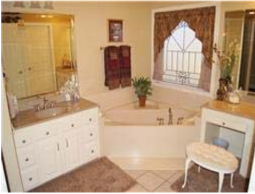
Master bath - double sinks, separate tub & shower