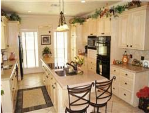
Lots of counter/prep space, coffee bar, built-in microwave & double-oven