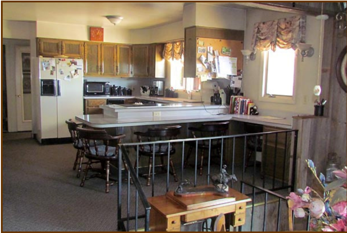
Open kitchen with breakfast bar.

Potential revenue for the property stems from a modular home lot on the property that generates $250 per month. There are also two large grain bins with electric fans which can be used or leased to neighboring farmers to dry harvested grains.