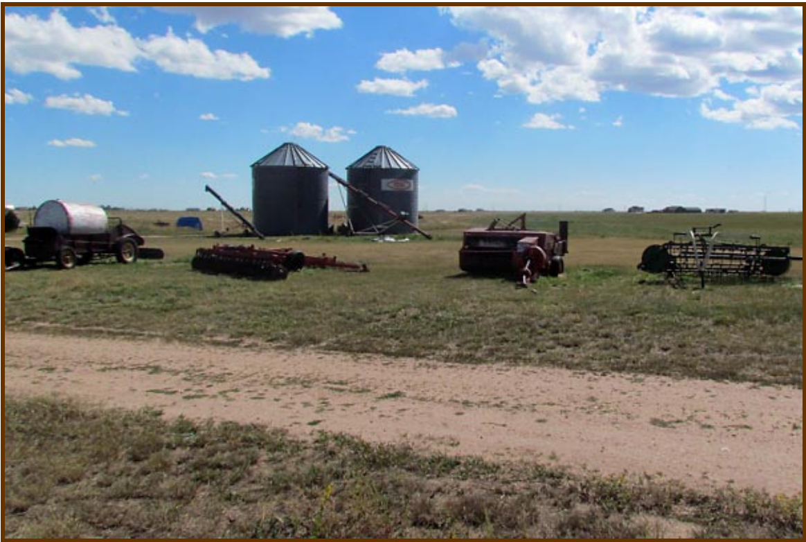
3,500 bushel grain storage bins with dryers on the floor.

Notice to Buyers: Wyoming Real Estate Law requires that the listing Broker and all licensees with the listing Broker make a full disclosure, in all real estate transactions, of whom they are agents and represent in that transaction. All prospective buyers must read, review and sign a Real Estate Brokerage Disclosure form prior to any showings. Clark & Associates Land Brokers, LLC with its sales staff is an agent of the seller in this listing.