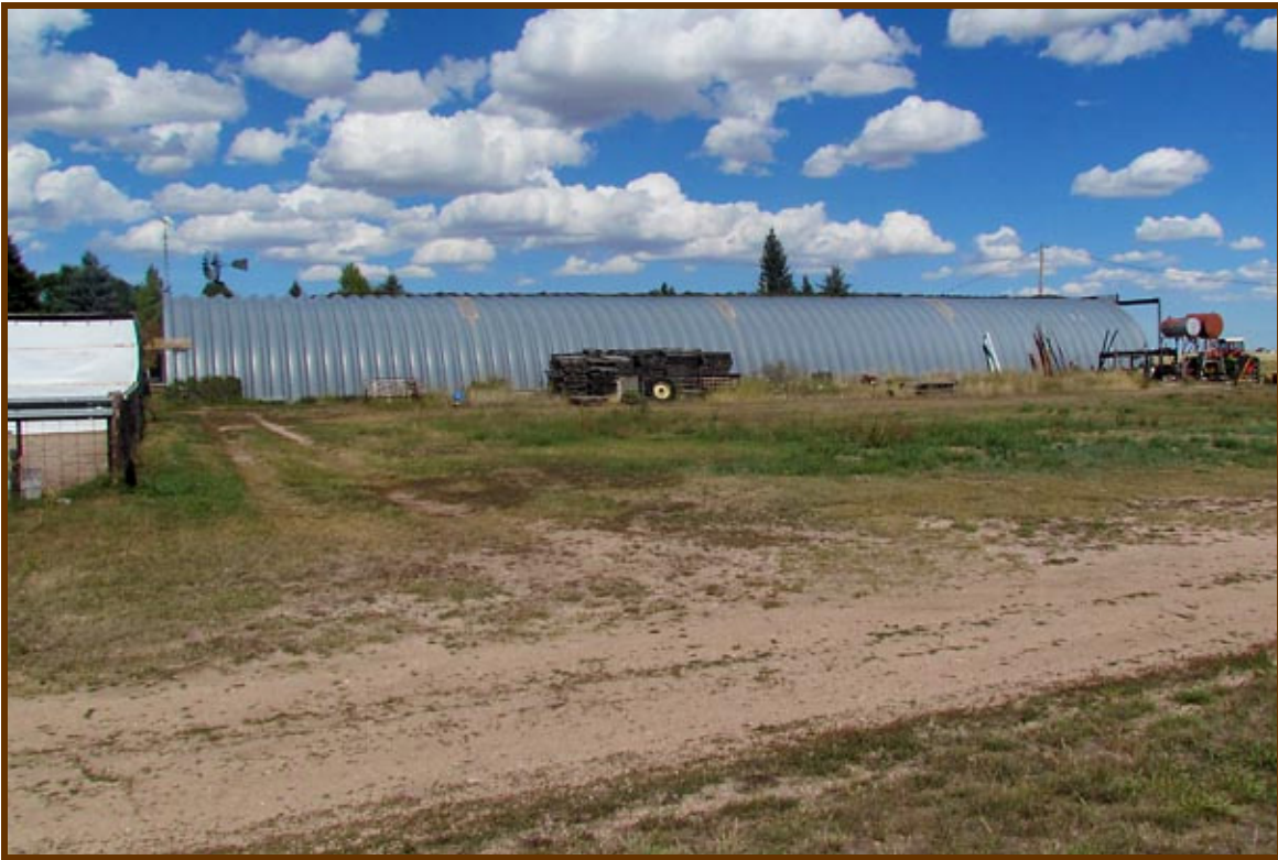
40' x 160' Quonset with a concrete floor. Used as a shop but constructed for grain storage.