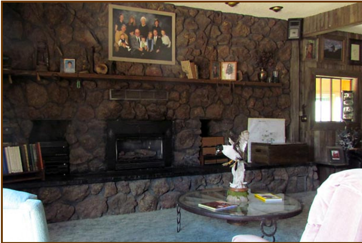
Custom/owner built home with beautiful rock fireplace.