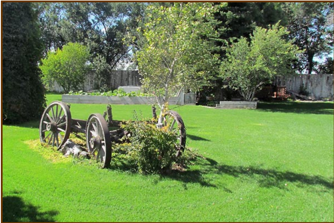
Beautifully landscaped yard with water fall, two sitting areas, windmill, water wheel, and wagon.