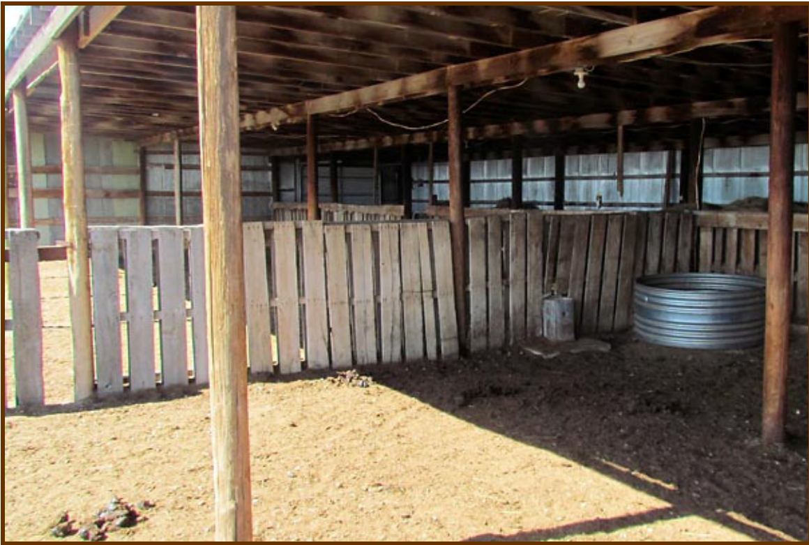
Multiple use barn with tack room and concrete floor.