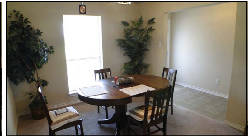
Dining Area off Kitchen