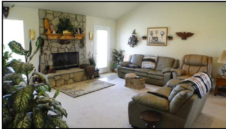
20x18 Living Room with Stone Fireplace