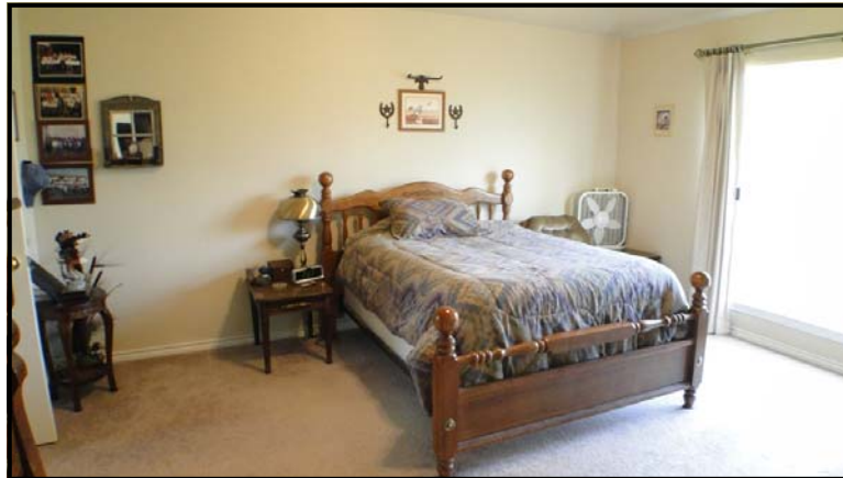
Light, Lovely Master Bedroom