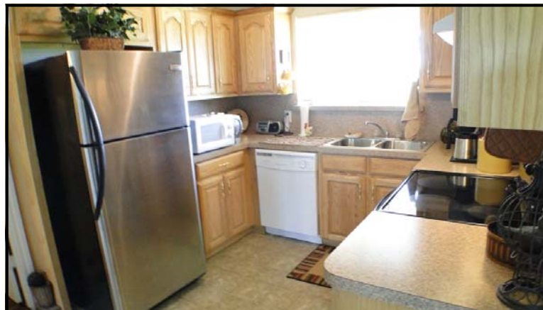
Bright and Airy Kitchen