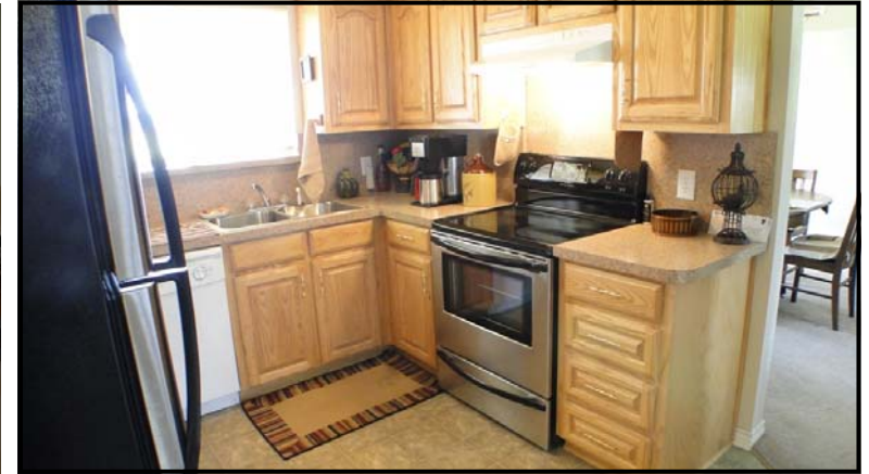
Kitchen overlooking Dining