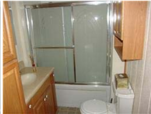
Guest home bathroom