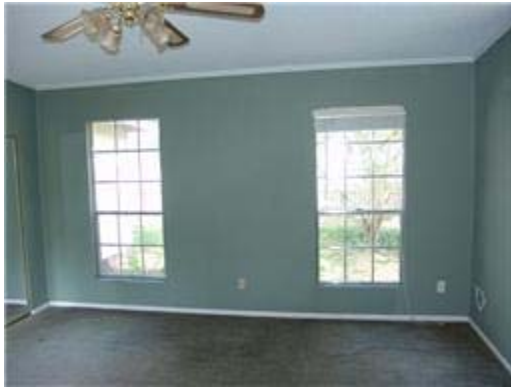
Guest home - master bdrm