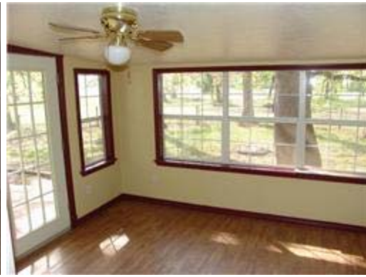
Guest home - living room