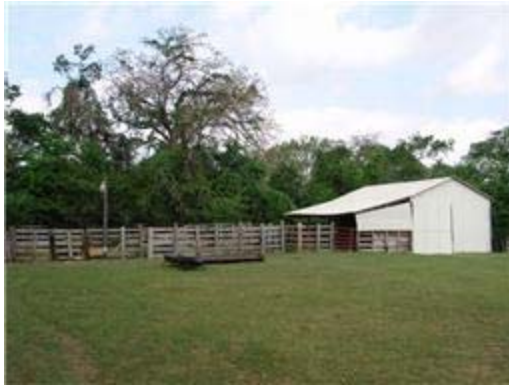
Barn w/ working pen & shed attached