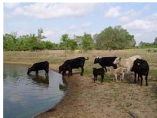
Cattle at the pond