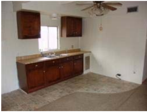
Guest home kitchen/dining