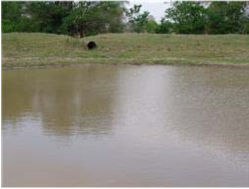
1 of the 5 ponds located on property