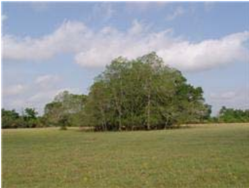
cluster of trees