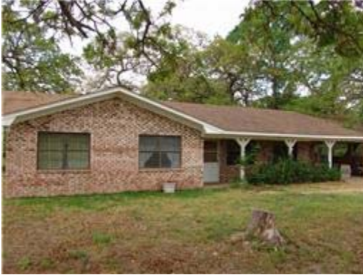
Front view of main home