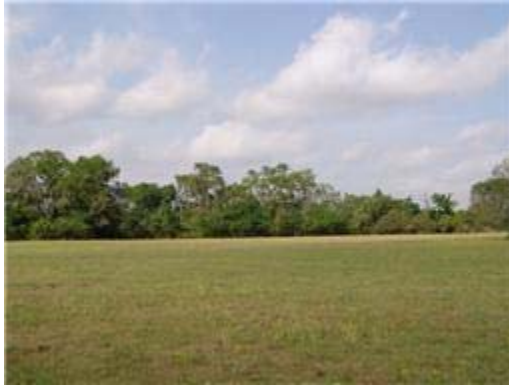
Wide, open spaces!