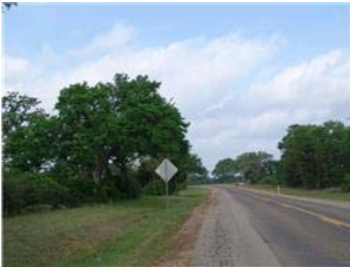
Blacktop road frontage