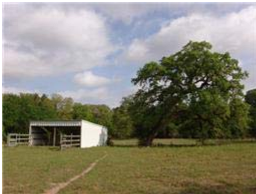
Horse stalls & tack room