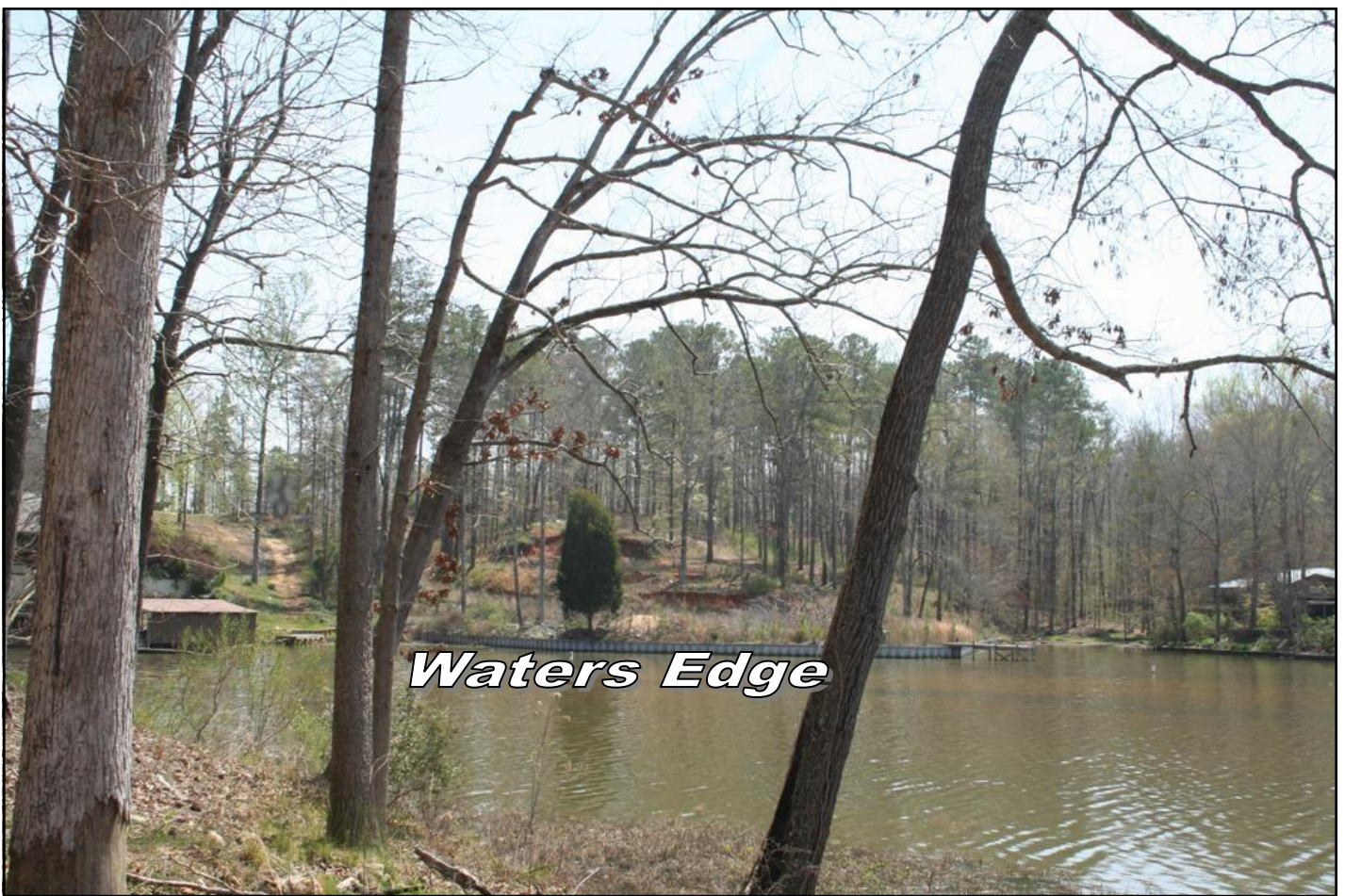
Looking back across Lake Jordan towards property