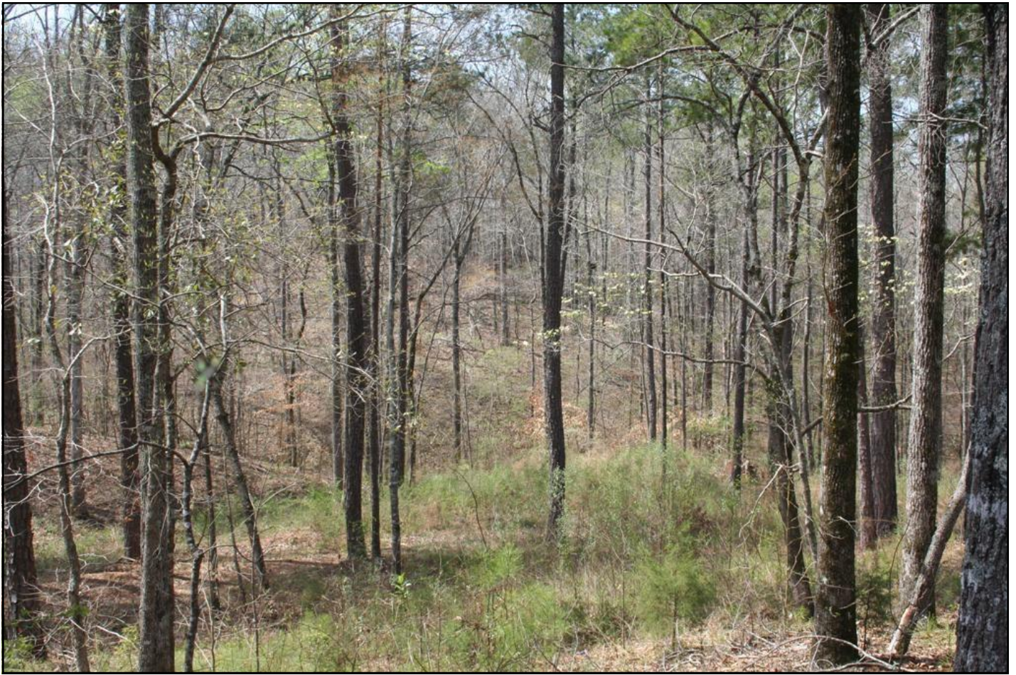
Nice hardwoods and pines on Phase One of tract enhance homesites