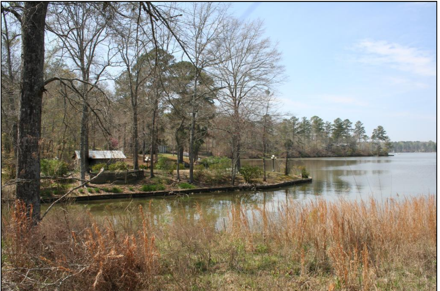
View from Waters Edge looking northwest