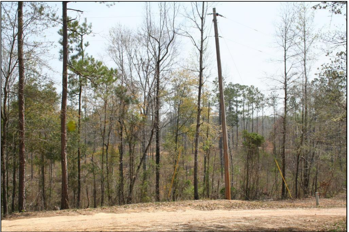
View east towards area designated for future development along creek