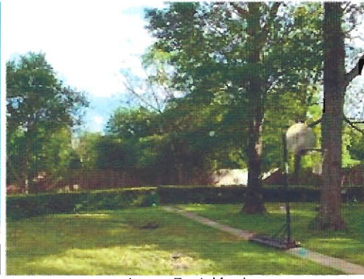
Large Back Yard