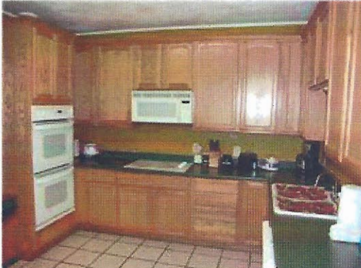
Kitchen - light and bright