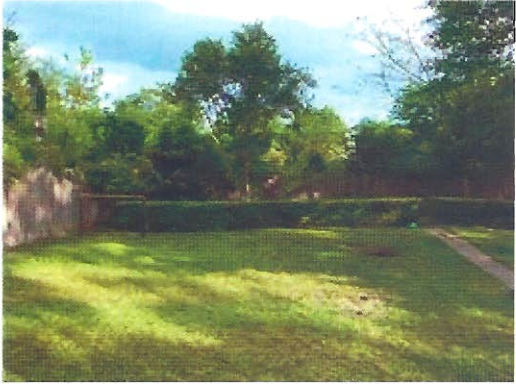
Back Yard Showing Privacy Fence and Shrubs