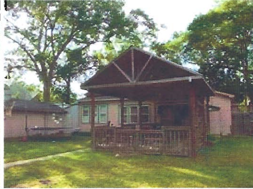
Featuring Covered Deck