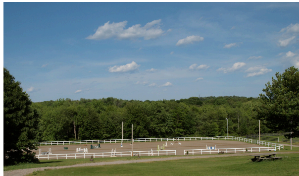
Indoor riding arena approximately 180x 80