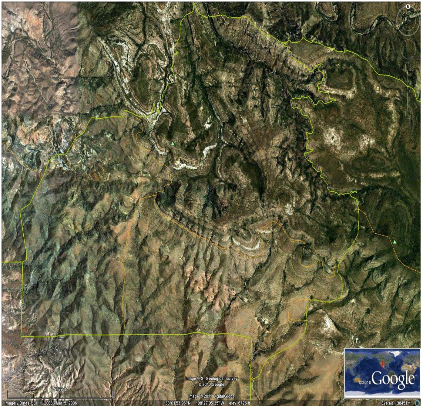
Google Earth map of the Spar Canyon Forest Allotment. This allotment allows 75 head year round.