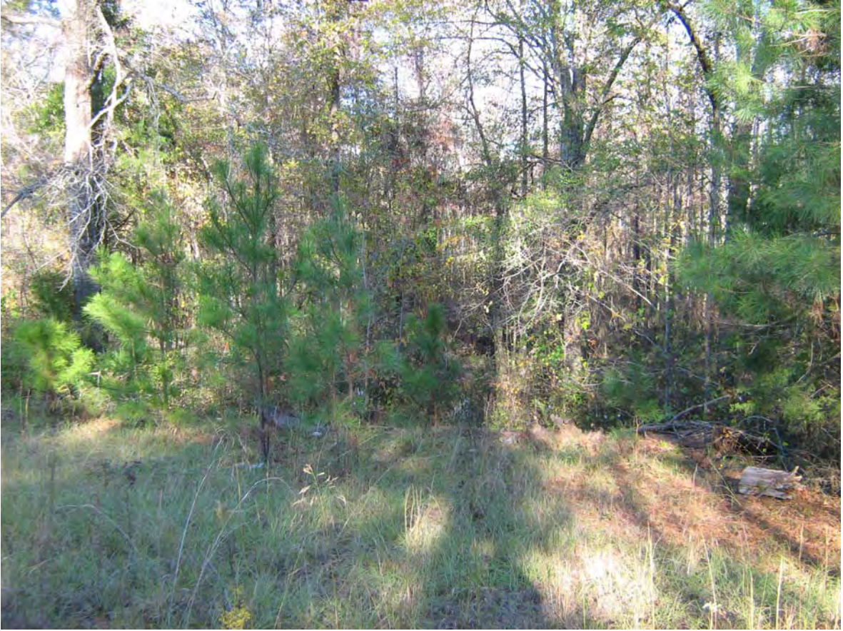
opening on the edge of the hardwood