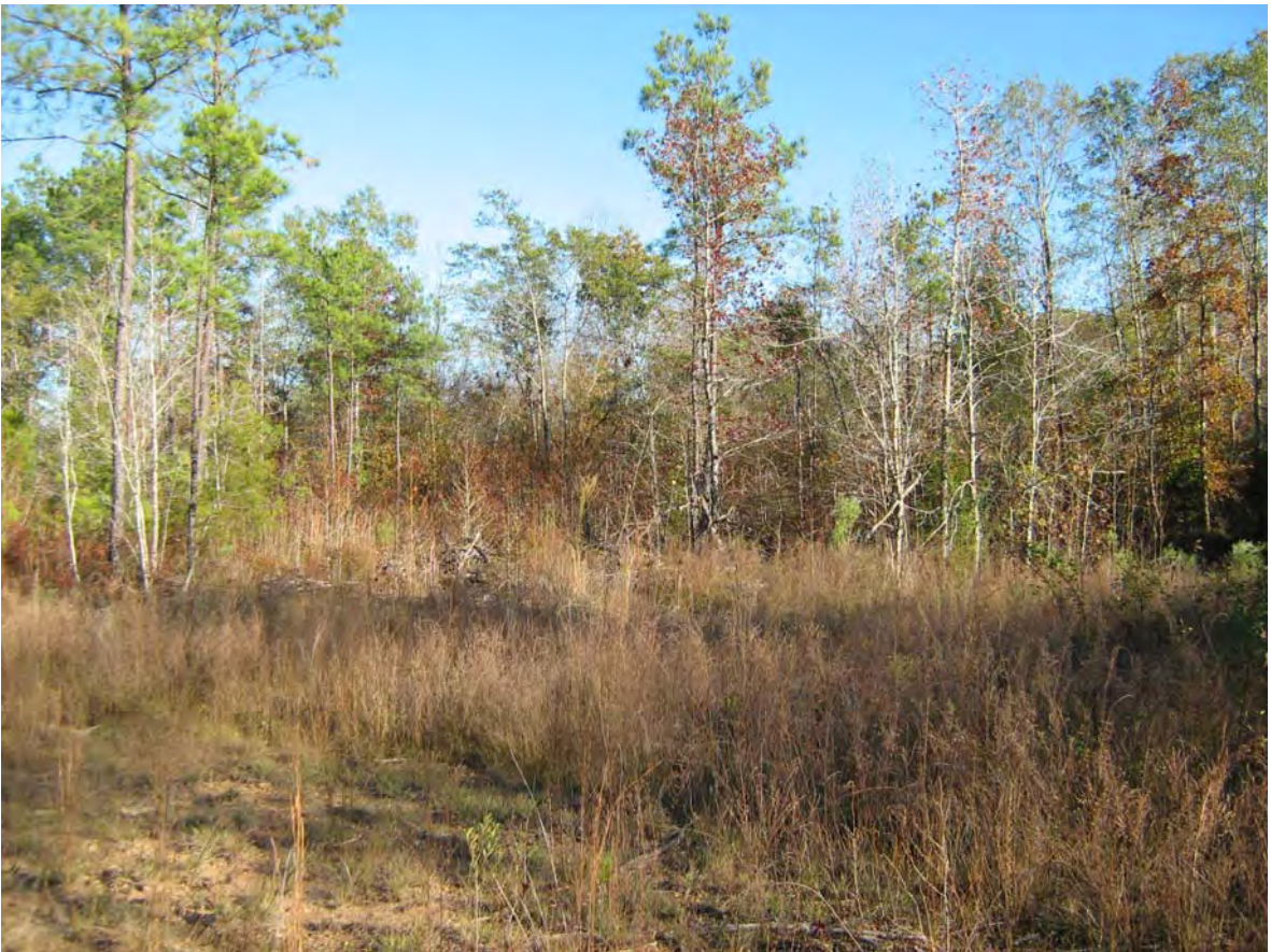
Another wildlife opening