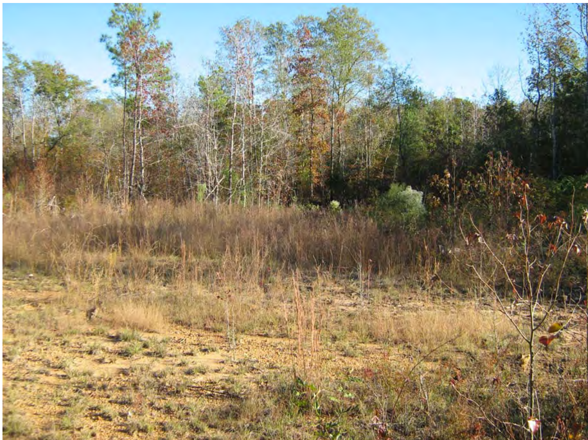
opening left after timber harvest – wildlife love these