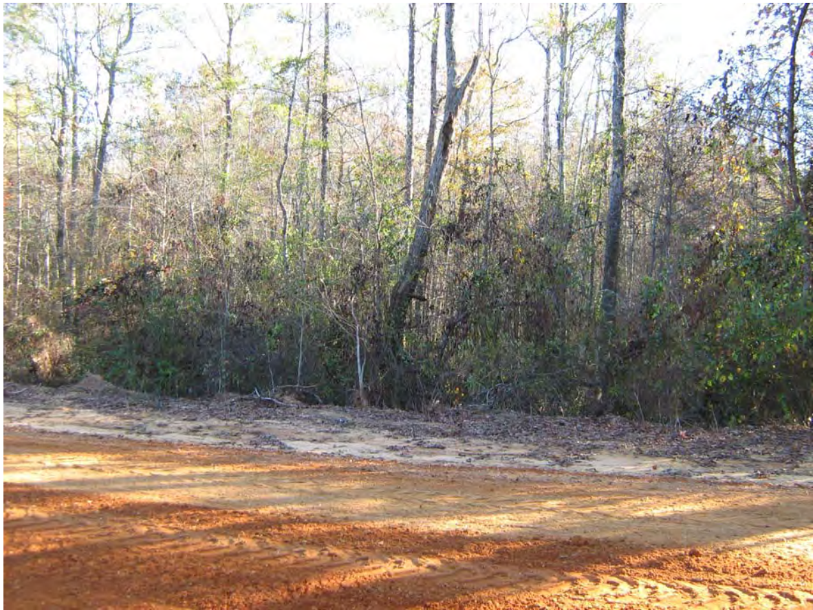
frontage on Steedley Rd