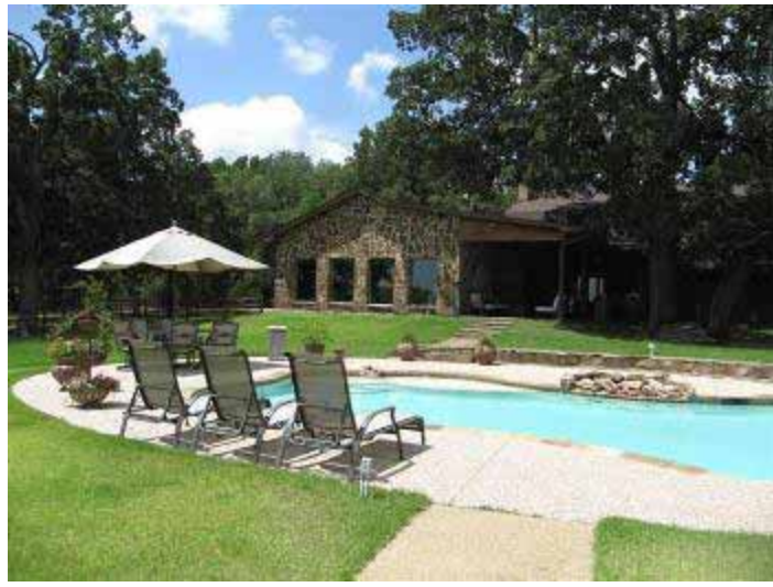
The generous covered back patio provides ideal outdoor dining, entertaining and lounging potential above the pool. Built 3 years ago, this 4' heated sport pool with 2 tanning ledges s nestled in a park-like setting with an incomparable view!