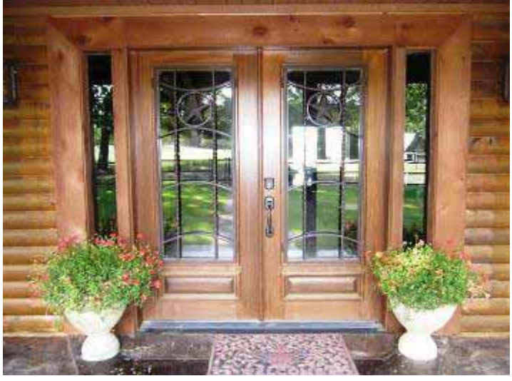
This 197 +/- ranch nestled in Kaufman is crowned by a 4000 SF, 4 bed and 4 bath Satterwhite Log and Oklahoma River rock home with covered front porches opening off both stories and a gorgous custom wrought iron and glass entry.