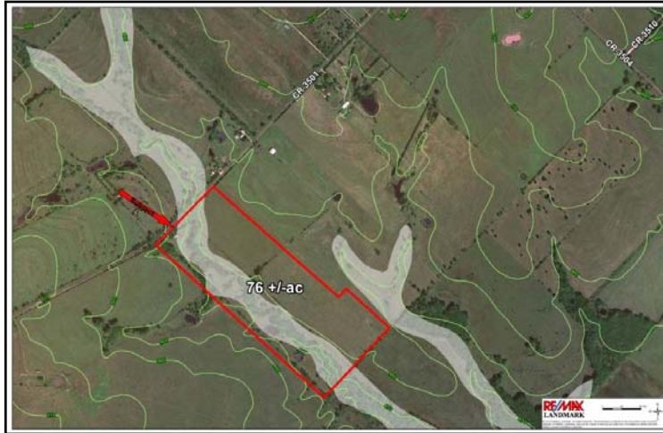
Aerial Elevation Map

Nestled in the peace of the country but only 45 miles from Dallas, this property offers both the quiet of country life with convenient proximity to the Metroplex