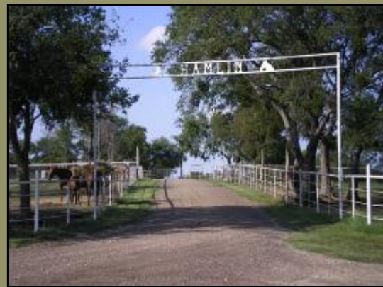
Piped entry to the main house completely tree covered and surfaced with recycled asphalt.