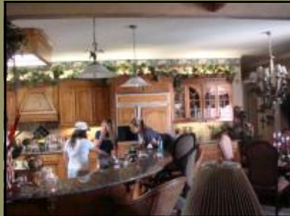
Impressive kitchen with curved granite tops and slate floors.