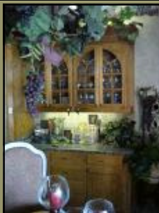
Lots of built ins through out