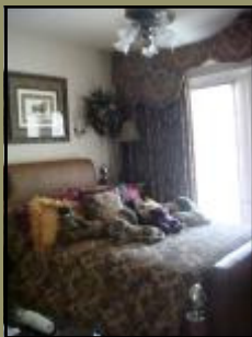
Well decorated and appointed