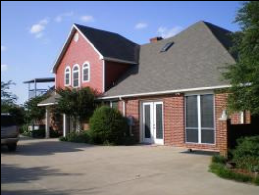
Impeccable Texas Design

Cell: 214-207-5431 | brett@hiviewrealestate.com