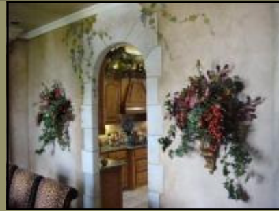
Hand detail through out this entire home