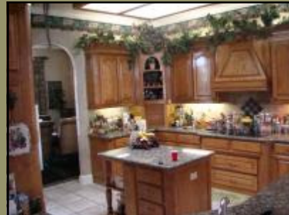
Cabinets galore in this Texas sized kitchen