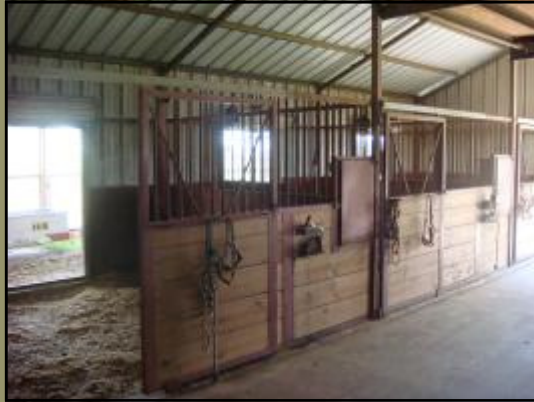
Extra large stalls metal lined, with piped fence turnouts and piped fence pastures.

Cell: 214-207-5431 | brett@hiviewrealestate.com