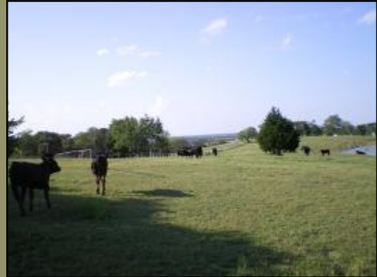
Rolling hills with lots of trees