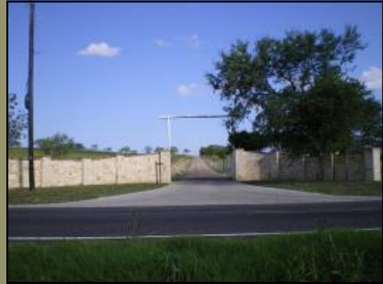
Grand Austin stone entry way and nearly one mile private drive to the main house.