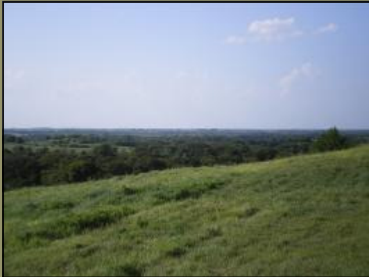
Views for 30 miles Can see Downtown Dallas