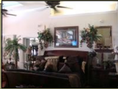
Master bedroom complete with sitting area.

Cell: 214-207-5431 | brett@hiviewrealestate.com