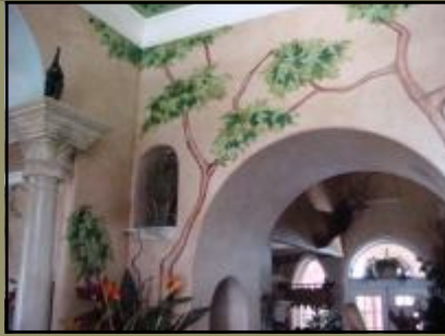
A grand entry complete with faux paint & murals.

Cell: 214-207-5431 | brett@hiviewrealestate.com