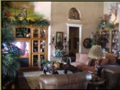
Living area with impressive built ins, faux paint and hand painted murals.