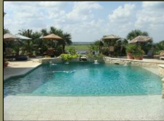
Beautiful pool/hot tub with fountains and waterfalls