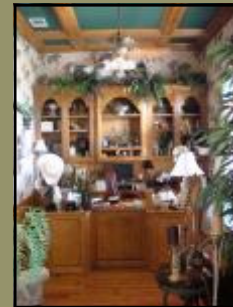
A statesman's office. Completely built in

Information contained herein has been obtained from the owner of the property or obtained from other sources that we deem reliable. We have no reason to doubt its accuracy, but we do not guarantee it.