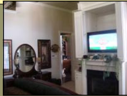
Fireplace and entertainment in the master.