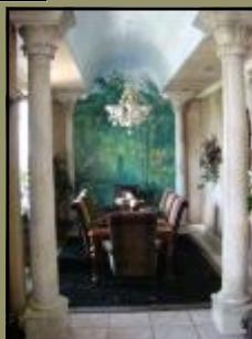
Incredible formal dining feels like your outdoors