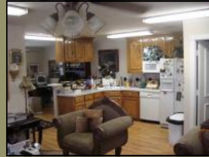
1500 sf Complete Living qtrs 2nd floor