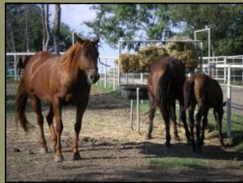
A place your animals can call home.

804 Ferris Ave | Waxahachie, TX 75165 | Ofc. 469-517-0012 | Fax 469-517-0015