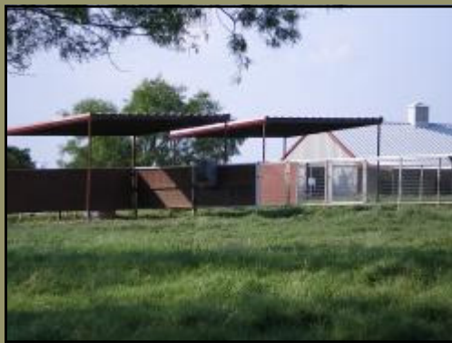
Loafing sheds in the paddocks to protect the livestock and complete with improved grasses.