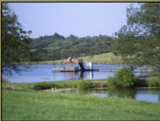
This eight acre lake is stocked with large mouth bass croppie and large cat fish. Complete with boat dock and fishing pier.