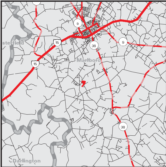
LOCATION MAP scale 1 inch = 5 miles