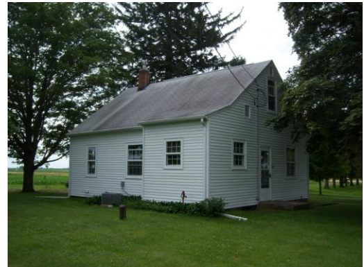
House – Rear View