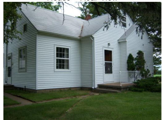
House – Front and Side View