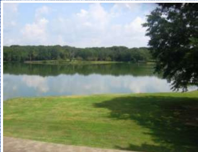
Lake view from the Loft