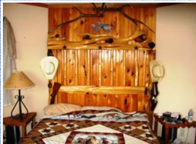
Built in Cedar Headboard