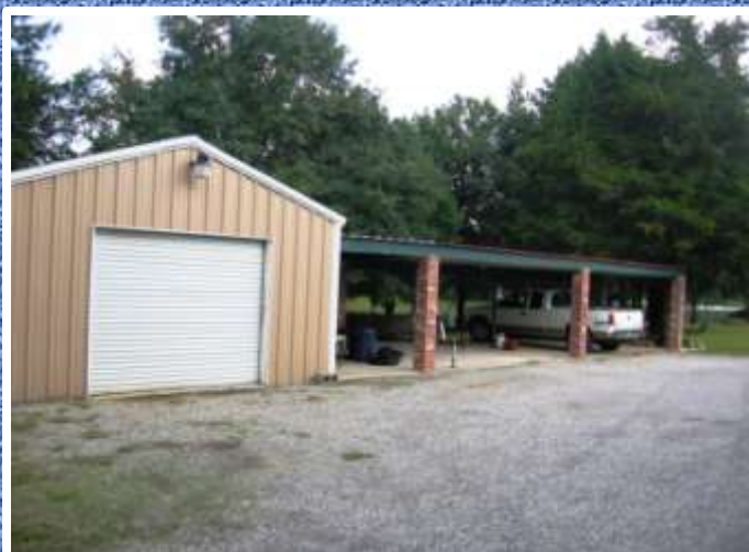
Shop and Carport