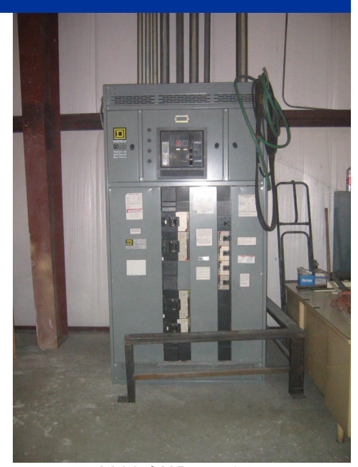
2200 AMP service. 220 VAC 60Hz