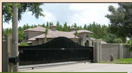
Next to Cheval Golf & Country Club (above)