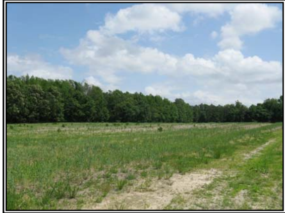
WOODLAND SURROUNDING CROPLAND