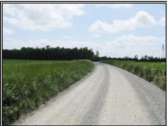
FRONTAGE ON ROUTE 682 (LEFT SIDE)