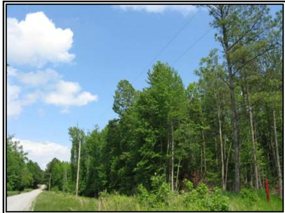
WOODLAND ALONG ROUTE 682