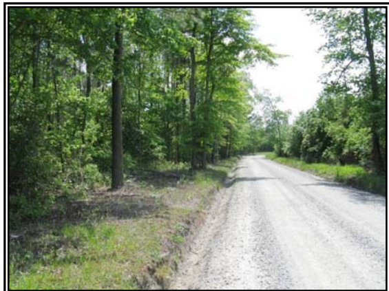
ROUTE 682 LOOKING WEST