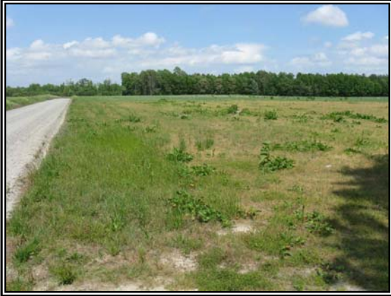
CROPLAND ALONG ROUTE 682