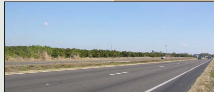
Hwy 60 Frontage