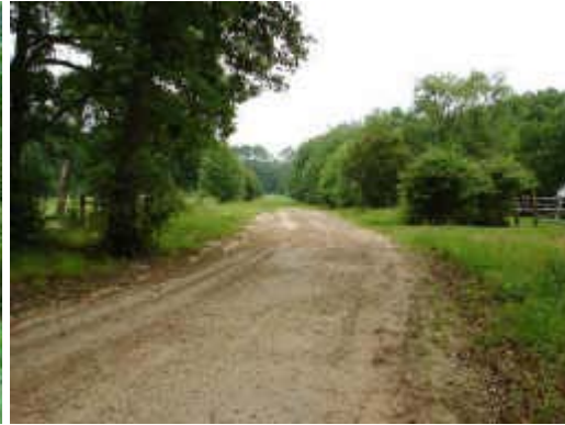
A view from Pin Oak Ln. looking south on the road easement toward the property.