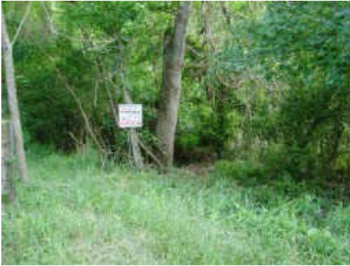
This is the entrance to the property from the road easement.