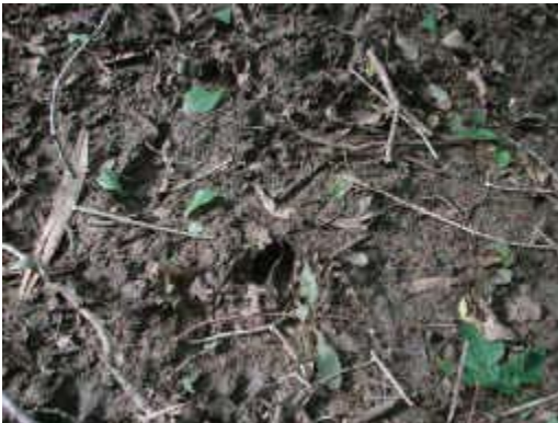
Fresh deer tracks.