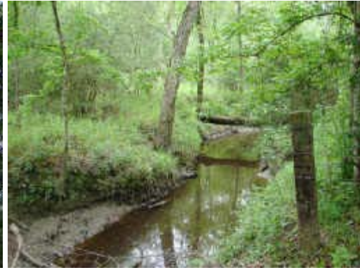
Standing on an adjoining property and looking into the 15.37 acres. Kickapoo Creek intersects the property.