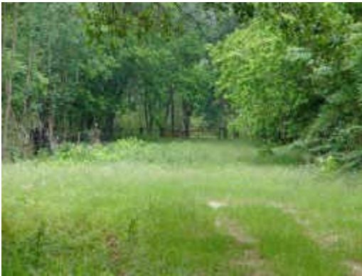
The road easement ends at this red gate. The property entrance is to the right of this gate.