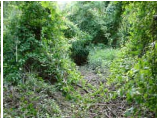
A wet weather creek bed at the front of the property.