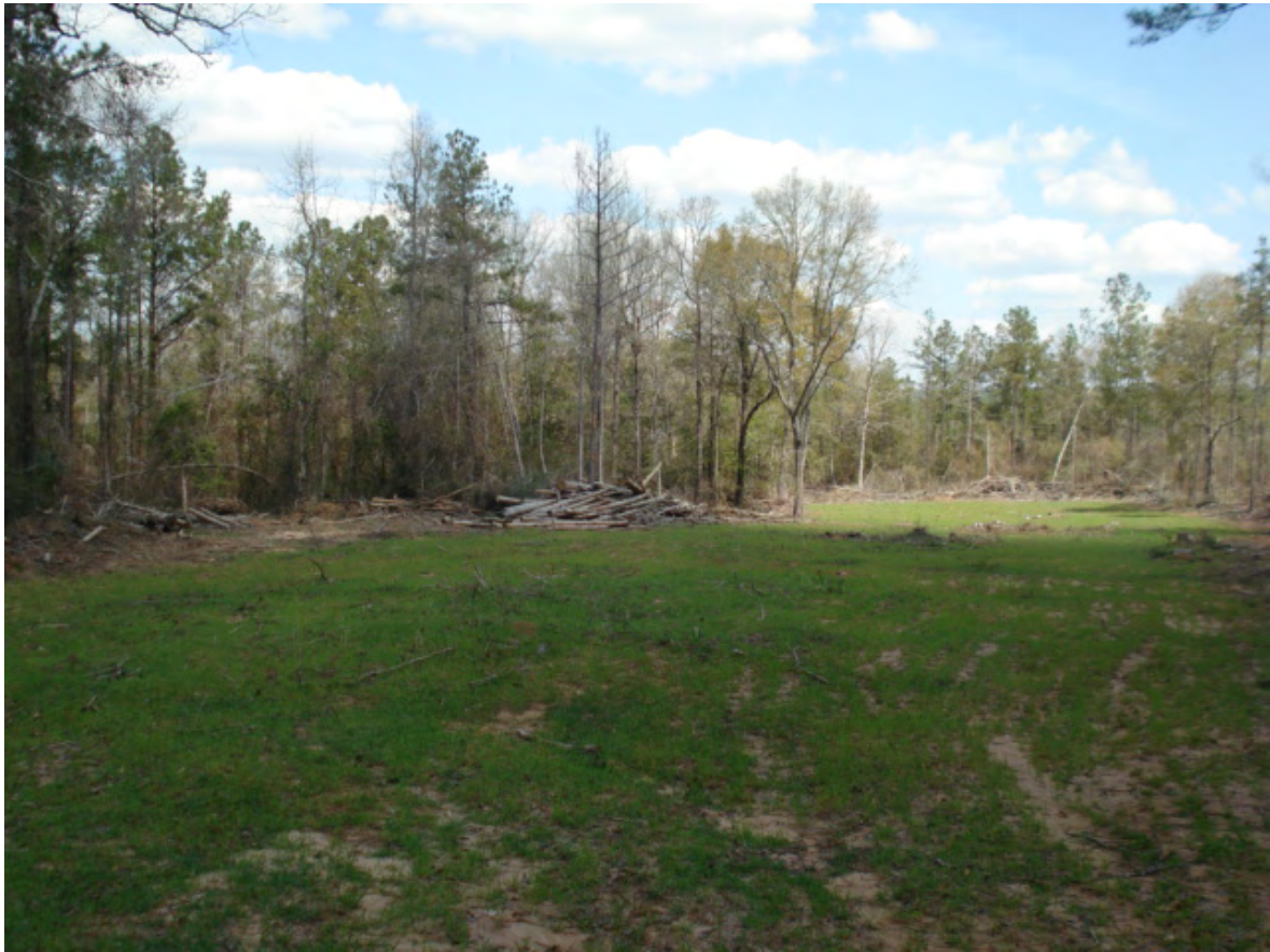
View of wildlife food plot on east side (one of 2)