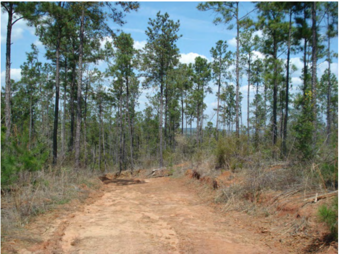
Access road into the property on south end