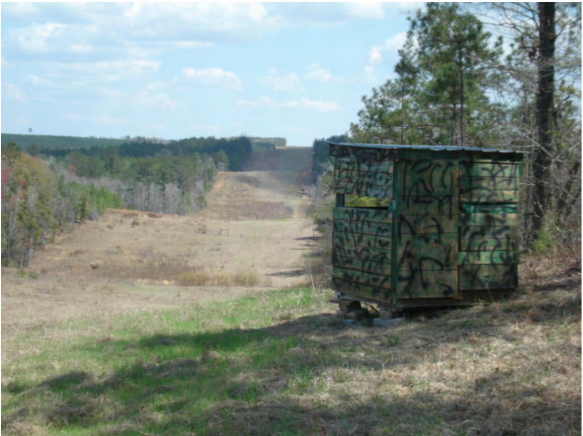
View of the pipeline looking northeast