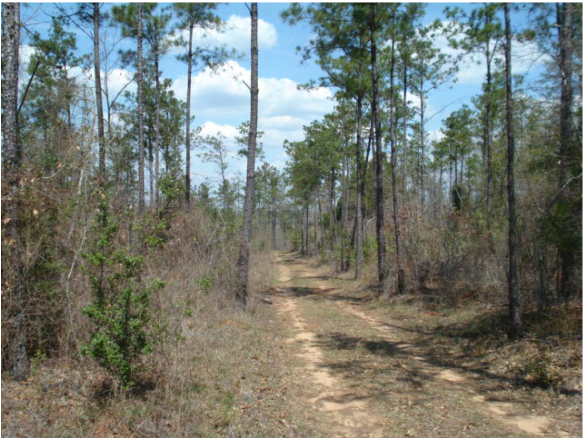
View of internal woods road