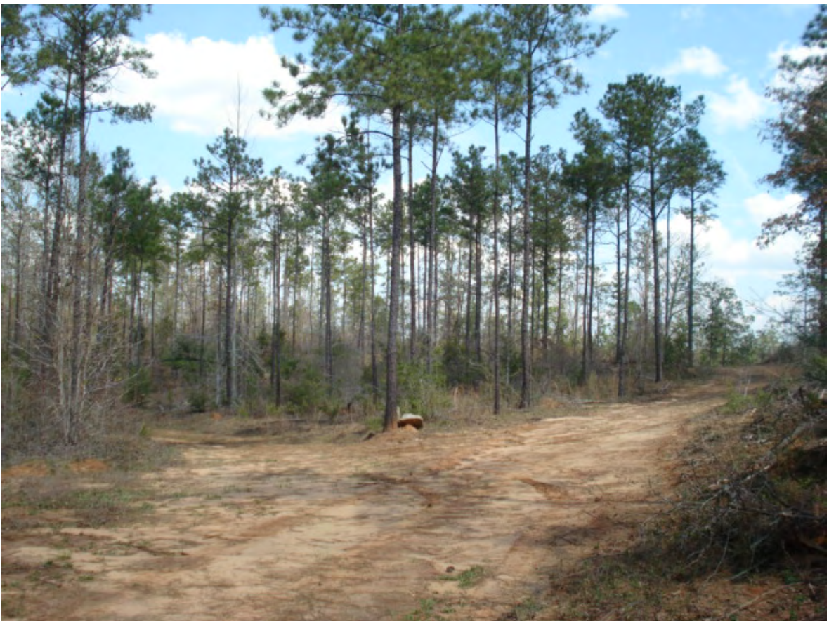
Where the woods road forks