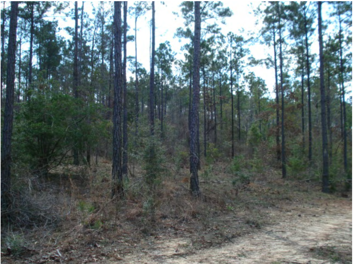
View of thinned pine plantations