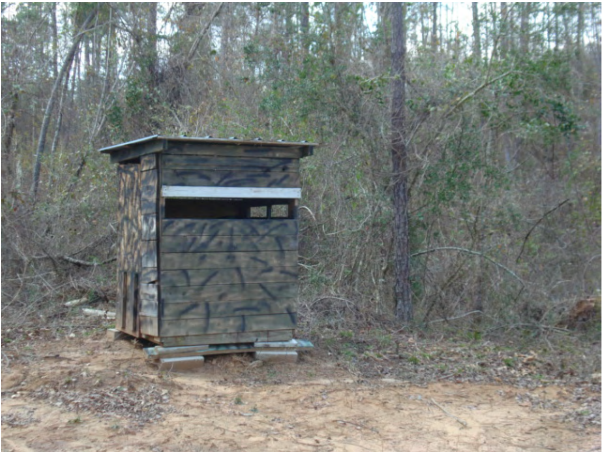
Shooting house on the eastern wildlife food plot