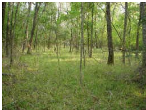
Another view of the hardwood bottom.