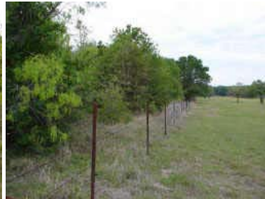
View of the east side fencing. The property is also fenced along the back (north) boundary line.