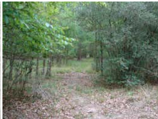
A cleared sendero marks the west side property line.