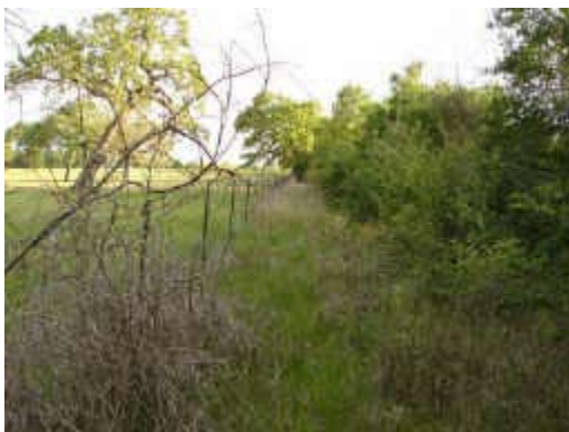
Looking south along the east side property line.