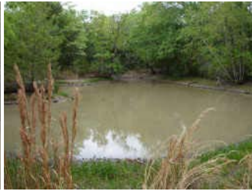
Another view of the pond.