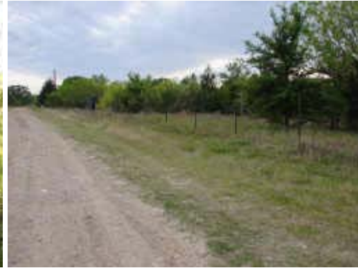
Road frontage on Misty Ln.