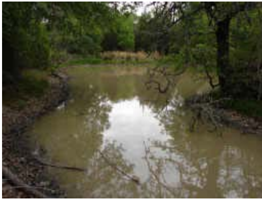
One large pond on the property. Great watering hole for the local wildlife!