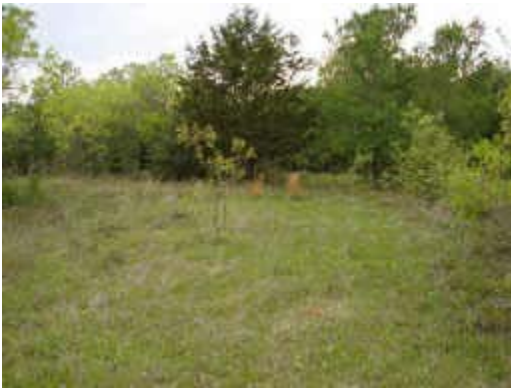
Clearing at the front of the property.