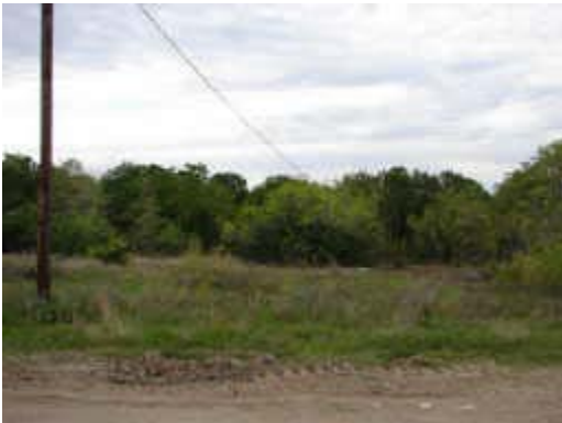
View from Misty Ln. of the electric line and pole on the property.