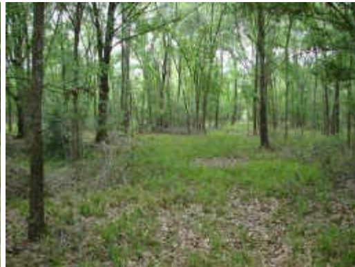
Lush vegetation in the hardwood bottom.