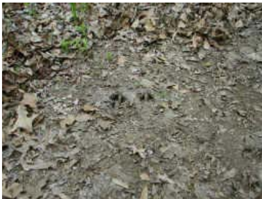
A few hog tracks.