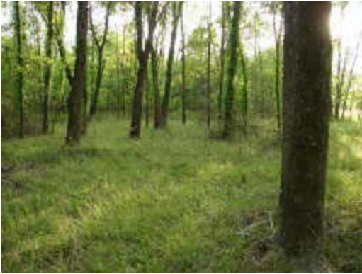
A view of the hardwood bottom on the property.